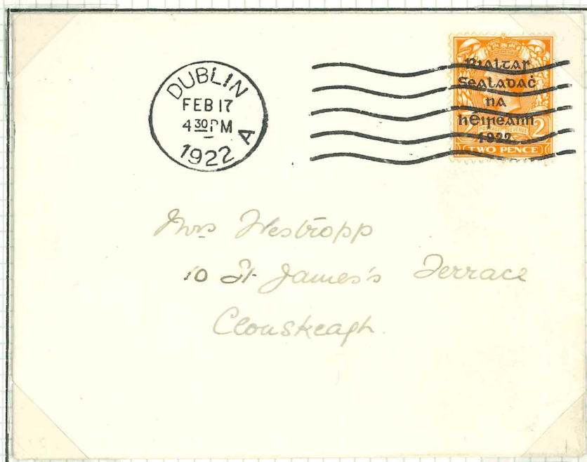
2d orange Die 1 First day of issue 17th Feb 1922.

Both dies overprinted in black by Alex Thom and Co Ltd., Dublin.