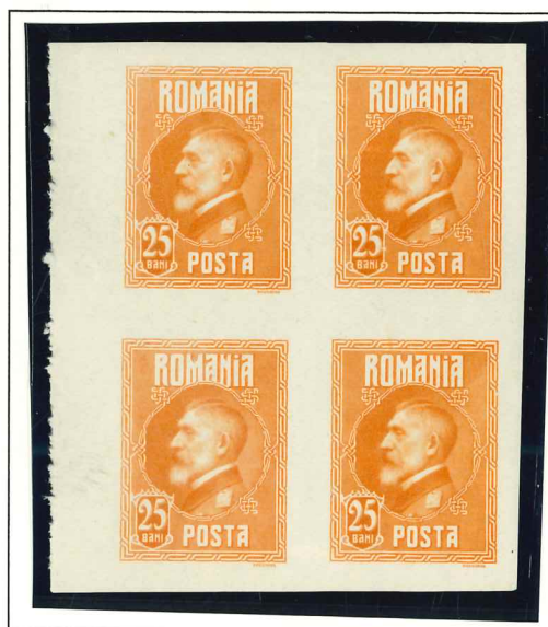
Imperforate block of 4