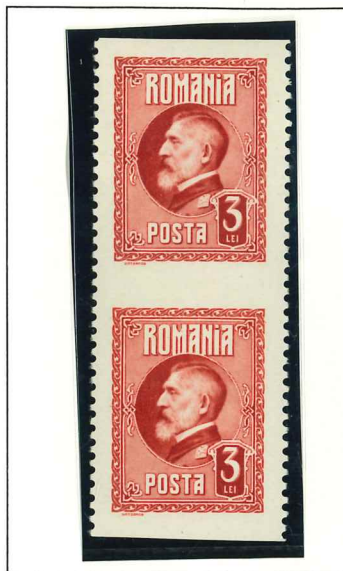
Vertical Pair – Imperforate Horizontally