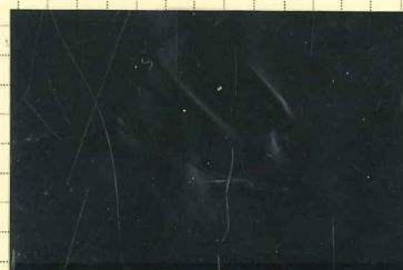
T76a (vfu) Flat accent over 'A' of 'SAORSTAT' Stamp from R9/2