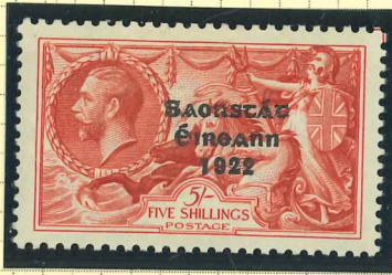
T76 (umm) Note dividing cross top right corner