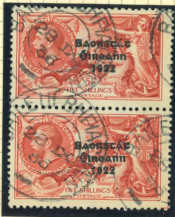
T76 Pair R4/2 & R5/2 (vfu)

Lower stamp from R5/2 displays dividing 'cross' which is set within the centre of the printed pane, with stamps from B & W plate 38550 A' pane.