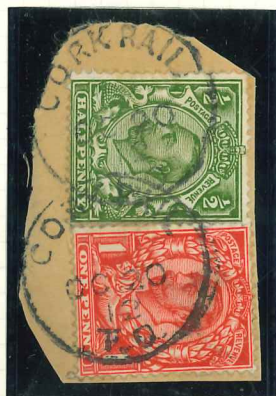
Great Northern Railway Company 2d stamp cancelled by