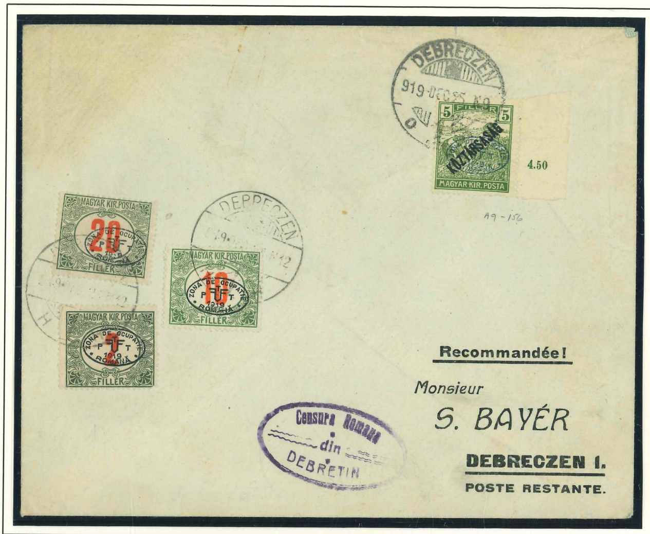
Cover - Locally Addressed

1st Issue - 5f Harvester with Koztarsasag, tied with a Debredzen CDS (919 Dec 25 / 0 1 0).