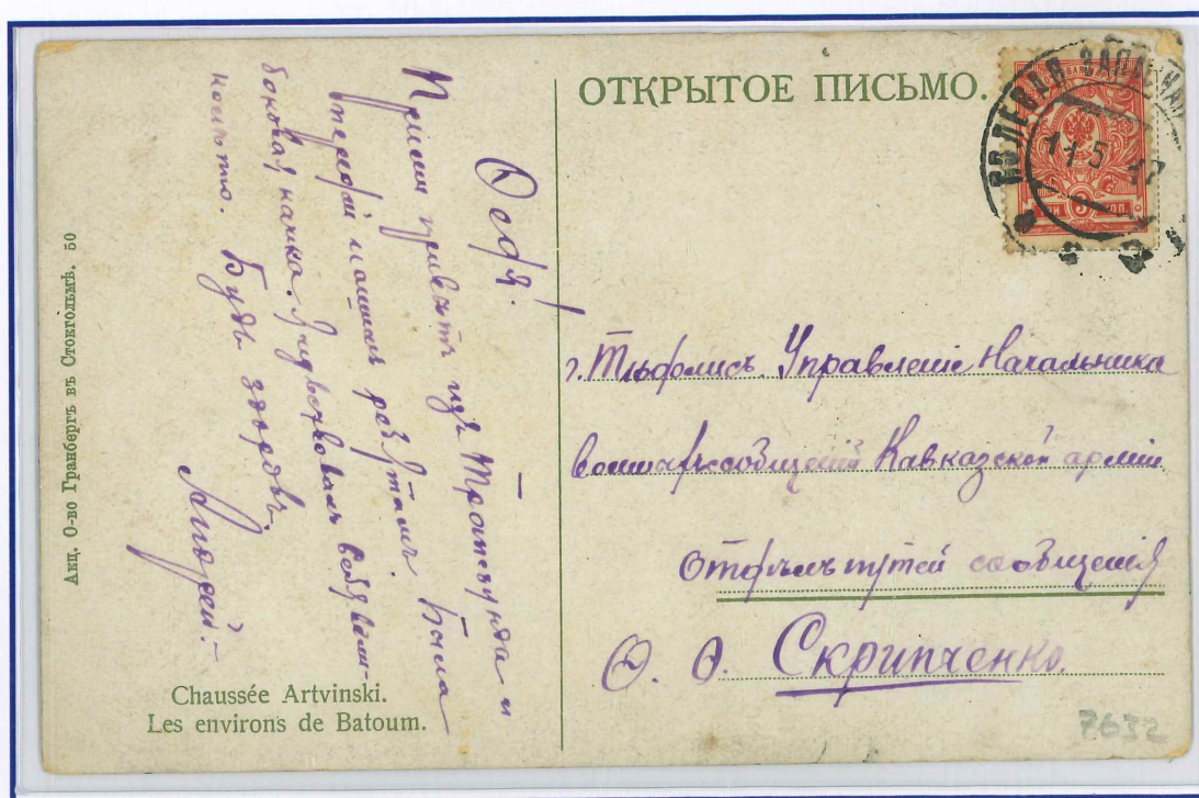
GREETINGS FROM TREBIZONDE FPO 159 CIVIL MAIL SENT THROUGH FIELD PO