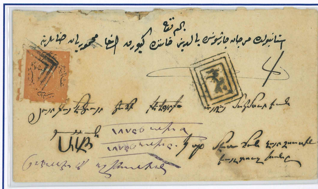
Dulos stamps tied by box BLACK SEA port AMASYA cancellation sent from Armenian to Constantinople RR