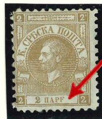
PARF. PLATE ERROR