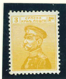
3 DINAR YELLOW, 1914