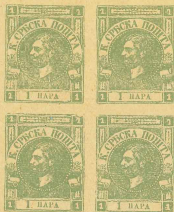
NEWSPAPER STAMP OF 1867