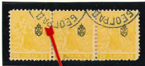
50 PARA PLATE ERROR IN-BETWEEN TWO 20 PARA STAMPS