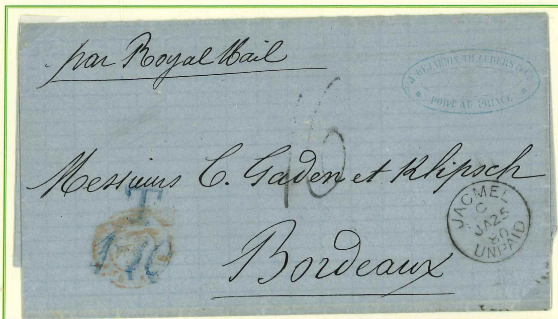
25 January 1880, from Jacmel to Bordeaux in France, delivered the 18th. Sent unpaid the blue handstamp 'T / 1-10' denotes postage due, the figure '16' (décimes) shows amount of postage collected on arrival, Endorsed 'Per Royal Mail'.