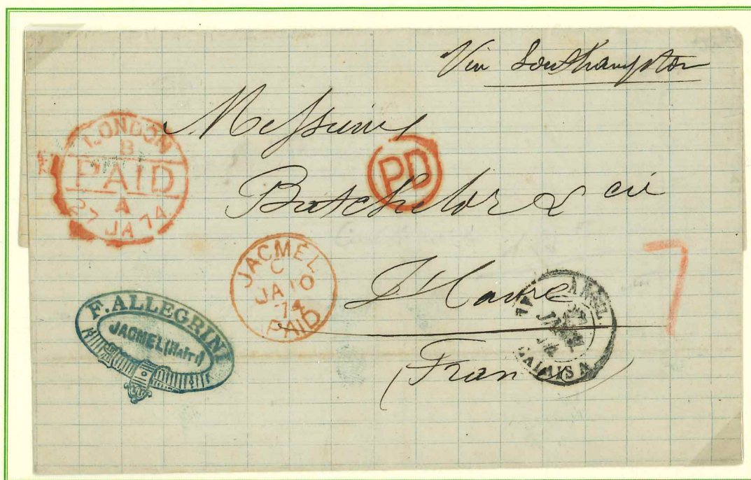
10 January 1874, from Jacmel to Caen in France, delivered free of postage the 28th. Rated 7 pence in red crayon, endorsed 'Via Southampton'.