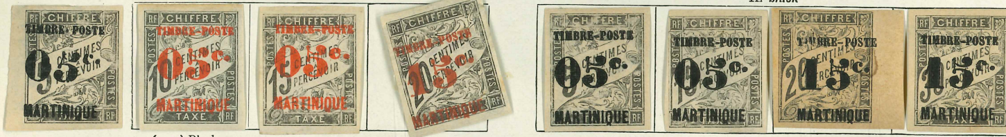
21 Tilted 5 Variety 25 (No. 19 a & 20) (to c.) Black 26 27 21 22 24