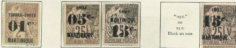
28 Brown on buff 30 31 29 32