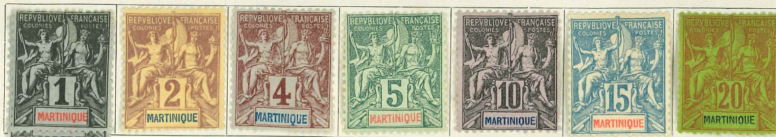
Black on azure