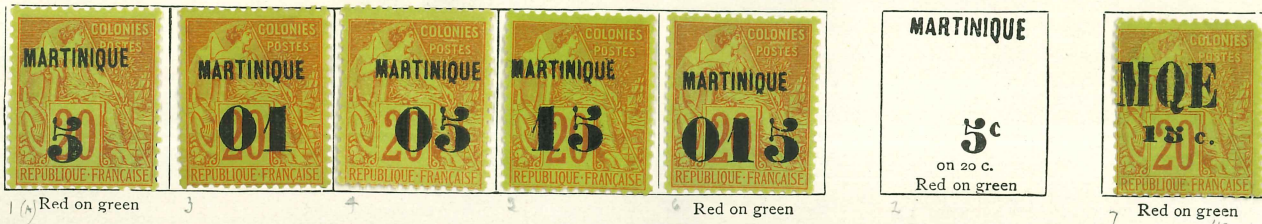
1 (A) Red on green 3 4 5 6 Red on green 7 Red on green