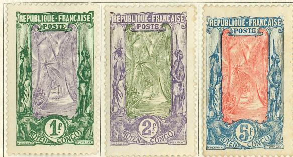
Green and violet