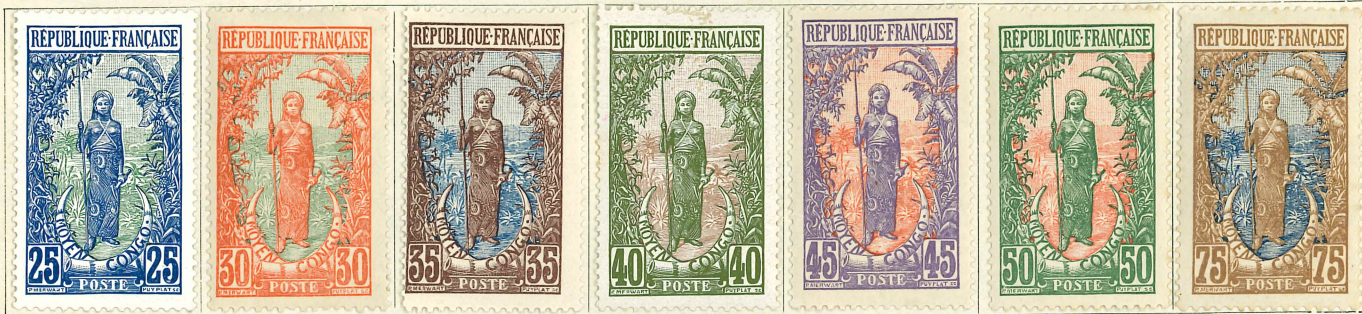
Blue and green