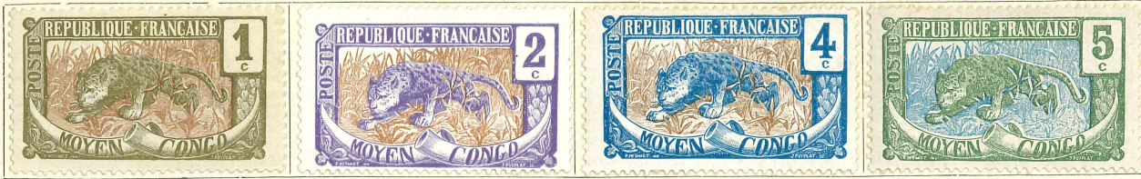
Olive and brown