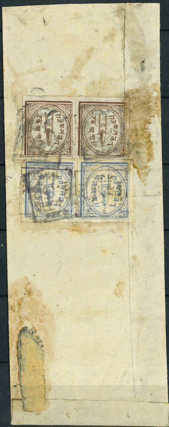
1 Annas B stone Positions 3, 7 Cancellations B1b - rated 'r' in Benns