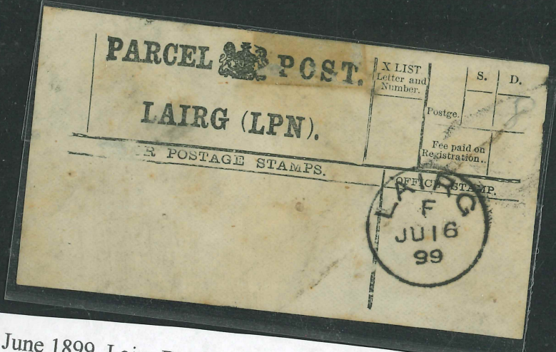
16 June 1899, Lairg Parcel Post adhesive label. 22 mm circular datestamp struck in form box, "Official Stamp"