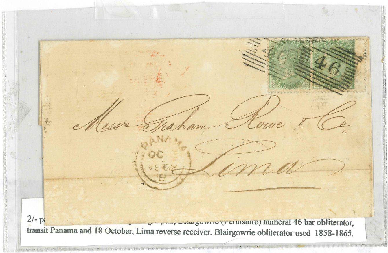
2/- p... Blairgowrie (Peru) numeral 46 bar obliterator, transit Panama and 18 October, Lima reverse receiver. Blairgowrie obliterator used 1858-1865.