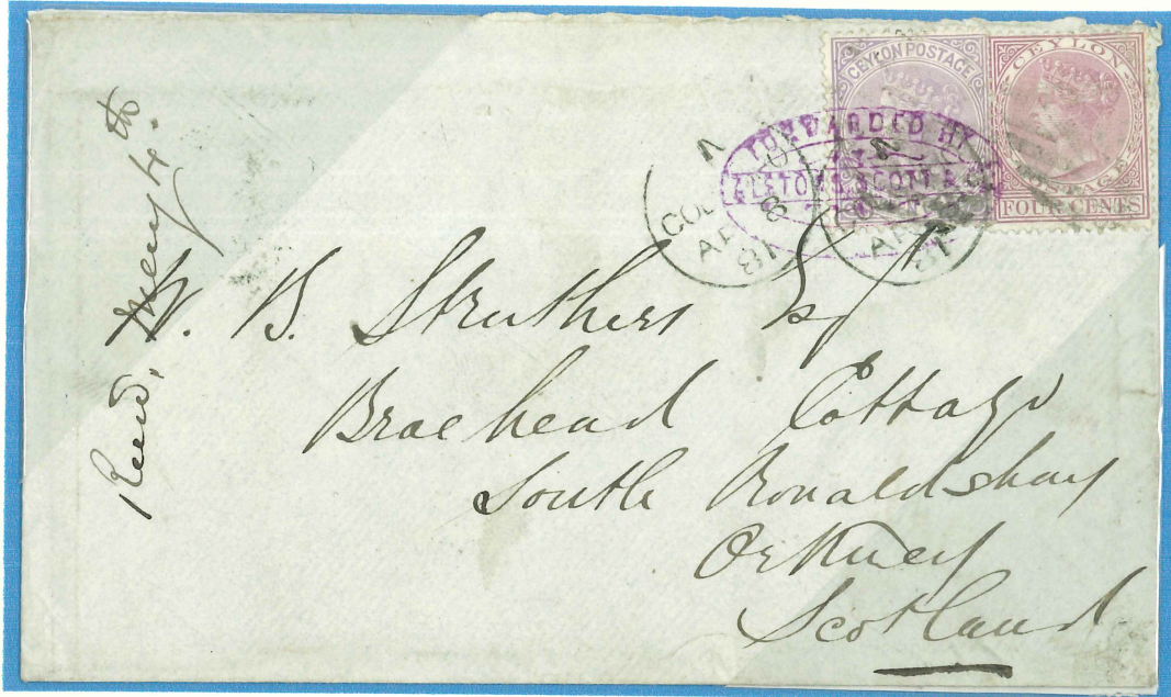
Colombo, 8 April, 1881—26 days

Ceylon entered the UPU in 1877, and a 20 cent rate via Brindisi was introduced 1 February, 1880.