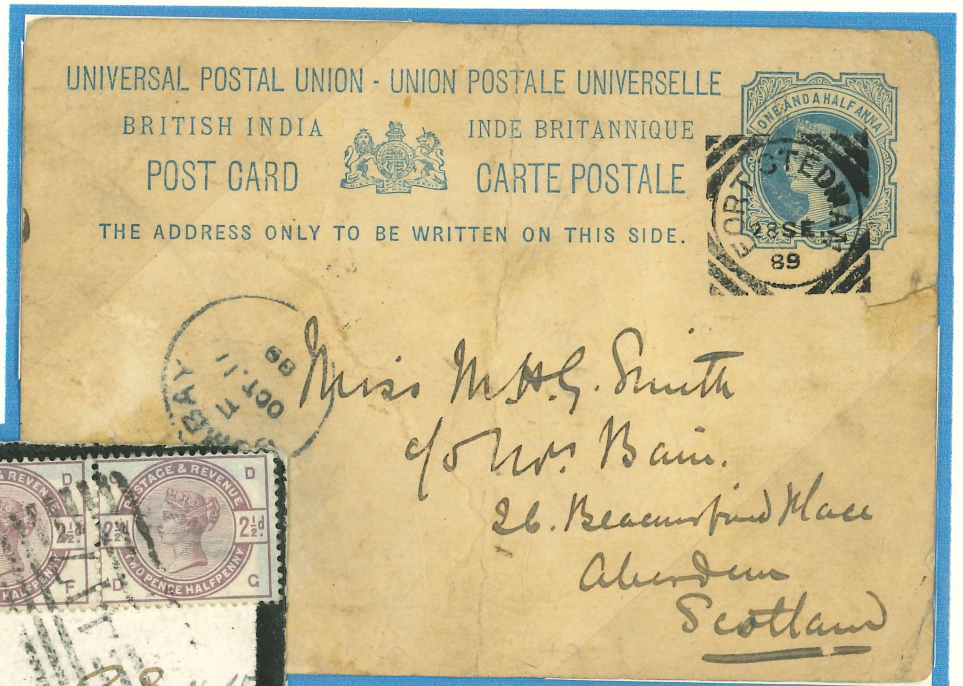
Fort Stedman, 28 September, 1889

Post Card rate to Aberdeen 11 October Bombay transit Postcard with no receiving date.