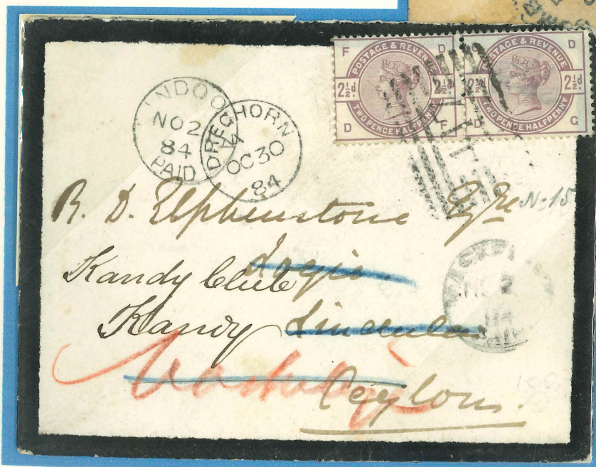
To Lindoola, Ceylon, 30 October, 1884—22 days

Paid letter from Dreghorn, Ayrshire, via London and Brindisi. Redirected to Kandy, Ceylon. Dreghorn 13 bar handstamp number 447 on Arrival 21 November, Lindoola.