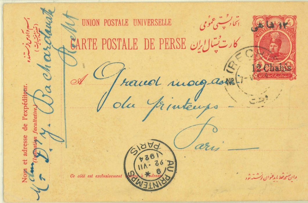
Type II Red Large "C" Surcharge displaced towards the left From Rescht 7-VII 24 To Paris 22- VII/1924