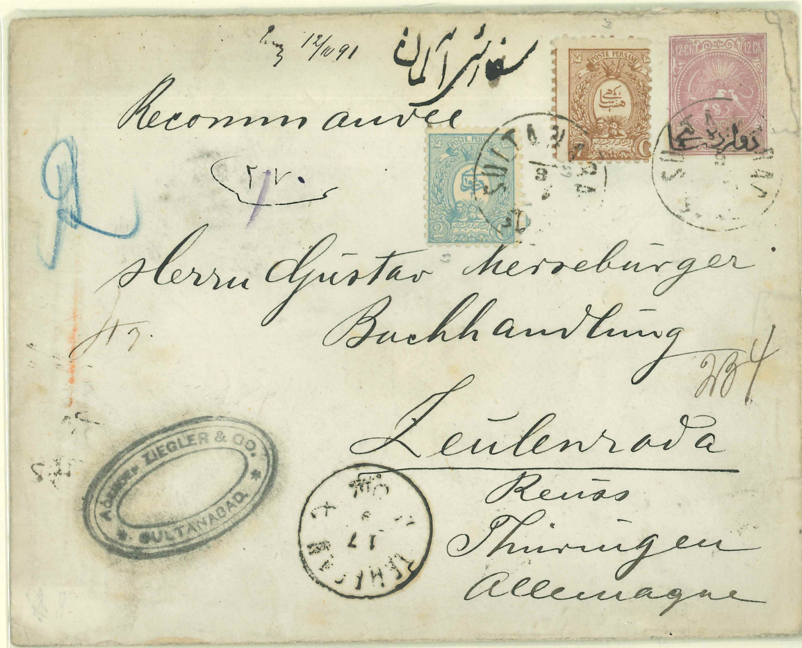
Type I Light red lilac From Sultanabad 1891 to Germany Rate 7ch Reg fee 14ch