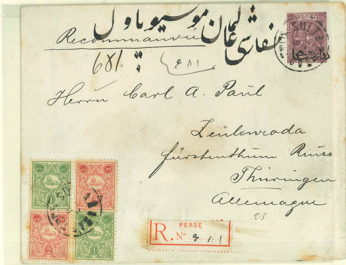
Type I Red lila Darker shade From Sultanabad (date illegible) via Teheran to Germany ab 1888/9 Rates: 6 chahi Registration fee: 12 chahi