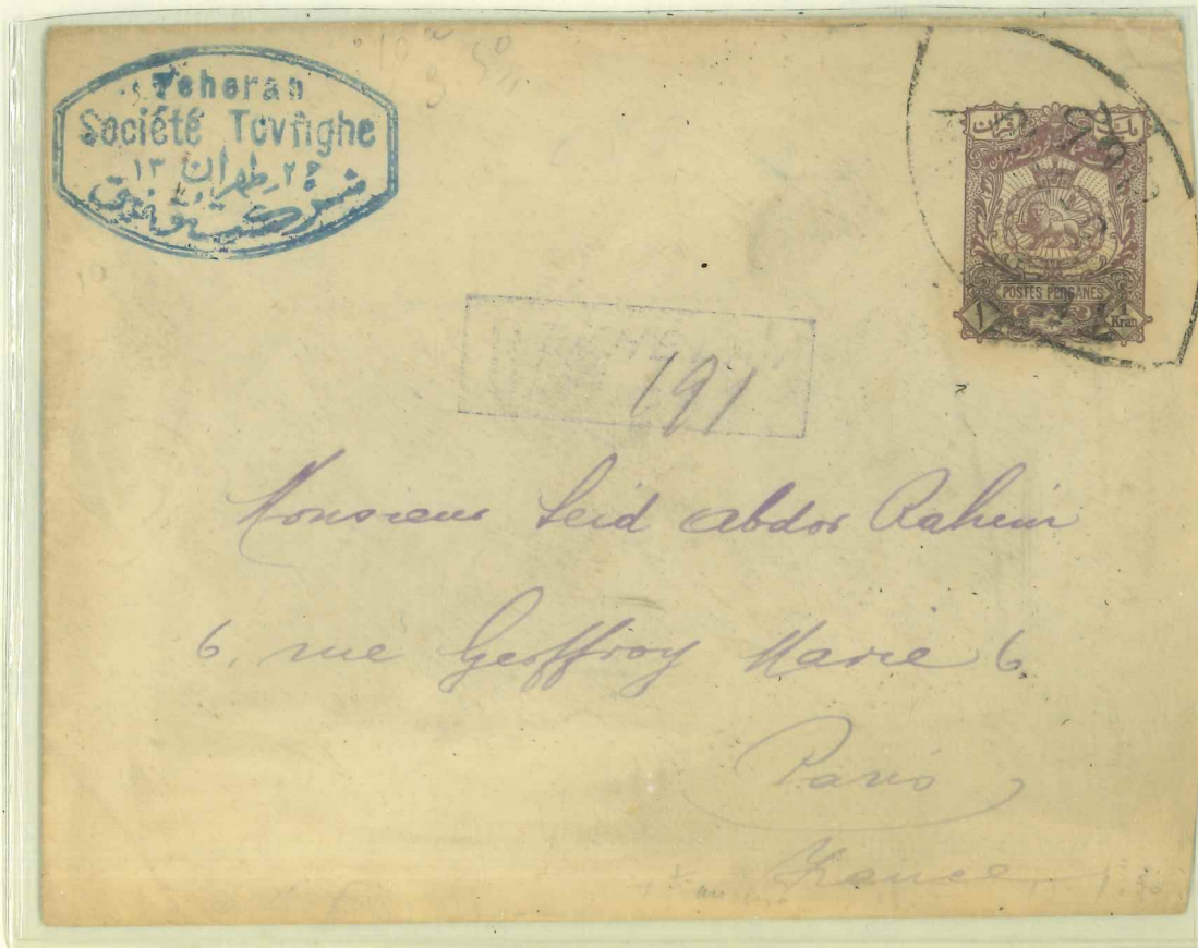
Registered cover to Paris in 1910