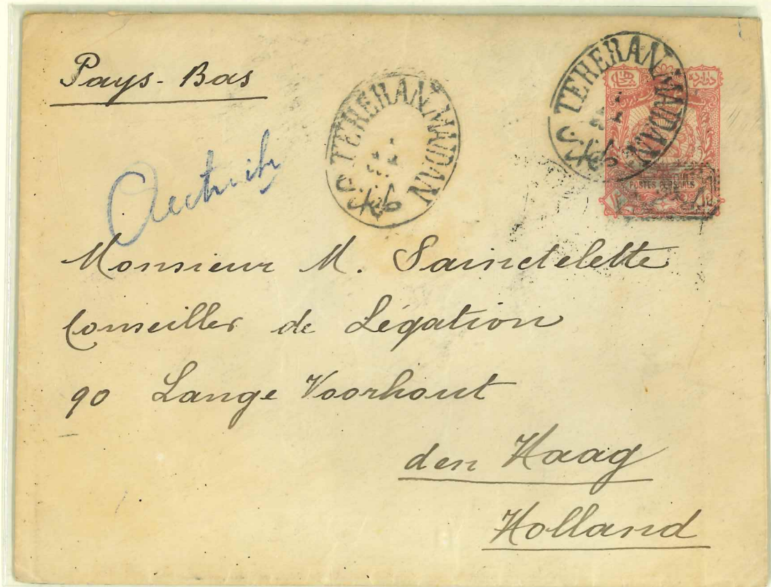
Cover to Holland in 1902

5 chahis External use Tabriz 17 Dec 1903 to France Rate 12ch (stamps at back)