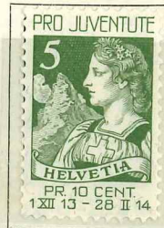
31 5 c. (10 c.), green