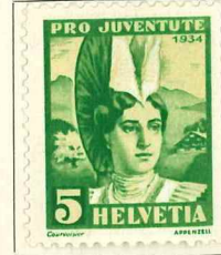
Green and buff