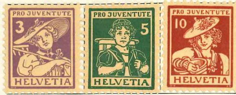
Green on buff Red on buff