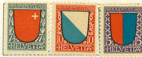
Red and slate Blue and red Red, blue, and violet