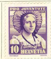
Violet and buff