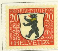
Black, yellow and carmine