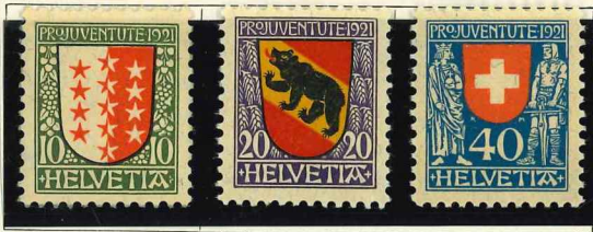
Red and green Black, yellow, red and purple Red and blue