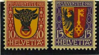
Black, orange and red Black, orange, red and violet