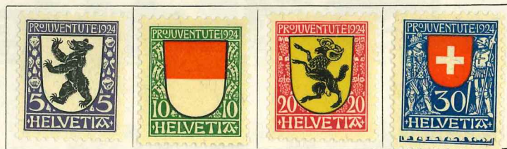
Black and lilac Red and green Black, yellow and carmine Red and blue