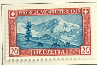
Blue and carmine