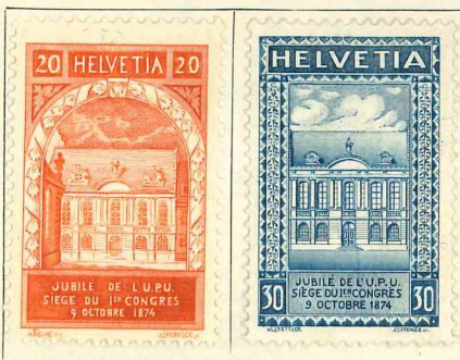
333/2 Red 334 Blue