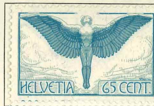
Die 1. 325/325w