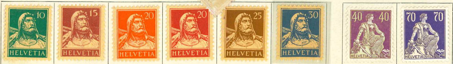
287 Blue-green 288 289 292 293 299 Green and magenta 295w