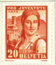
Red and buff