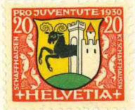
Yellow, green, black and red