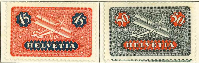
323 324/324 Black and red

1924. Shield and value in scarlet. Perf.