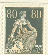
241 or 244 or