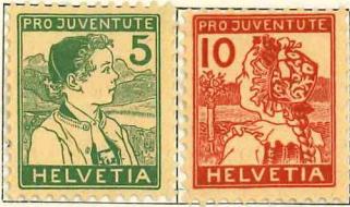
Green on buff Red on buff