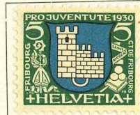
Blue, black and yellow