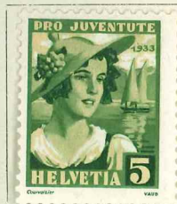
Green and buff