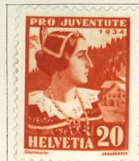
Red and buff