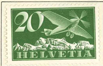
317 (20 c.) deep green