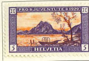
Vermilion and violet