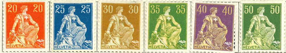
232 233 234 235 Yellow and purple 240 or