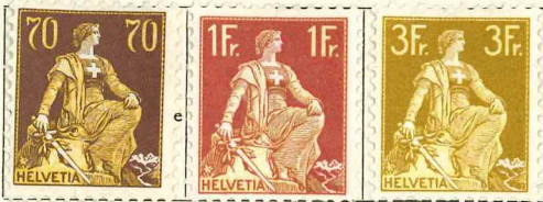
242 249 or