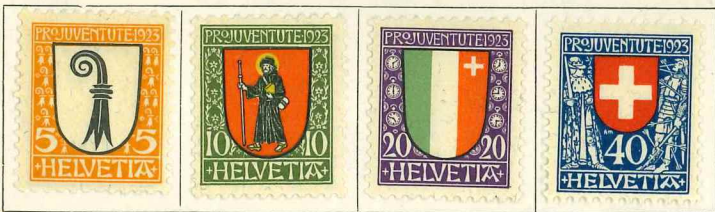
Black and orange Red and olive Red, green and purple Red and blue