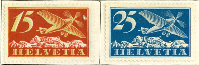
316 Red and green 318