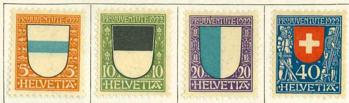
Blue and orange Black and olive Blue and purple Red and blue