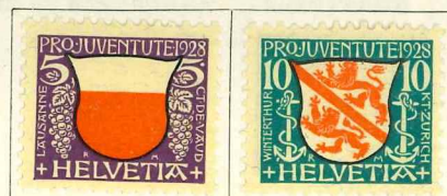
Red, purple and black Red, green and black