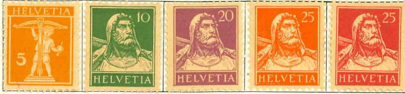
247 Orange on buff 248 Green on buff 249 250 251