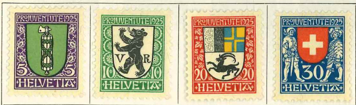
Green, black and violet Black and green Black, blue, yellow and red Red and blue