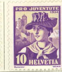
Violet and buff