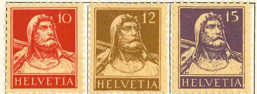
279 Red on buff 283 285 b

1915. Stamps of 1911, 1908, 1914, and 1907 surcharged