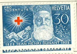
Blue and scarlet