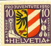
Yellow, black, red and violet