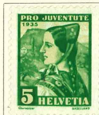
Green and buff