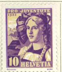
Violet and buff