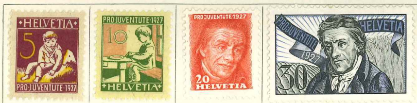
Purple and yellow Green and brown on green Scarlet Blue and black