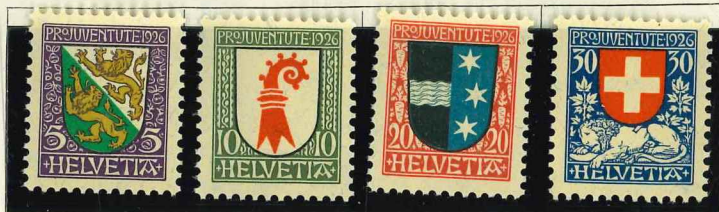
Purple, green and brown Green, black and carmine Carmine, black and blue Blue and carmine