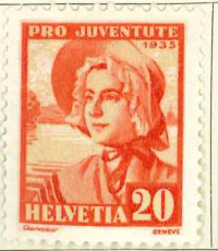
Red and buff