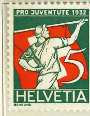
Red and green