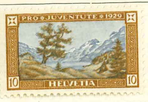
Blue and brown