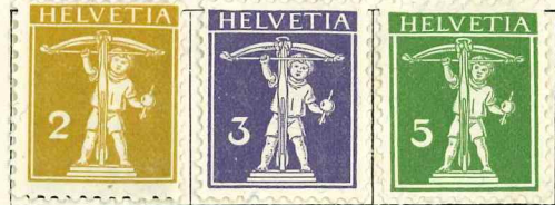
253 Bistre 248 263