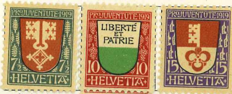
Red and grey Green and red Red and violet