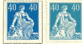
238 Blue 239