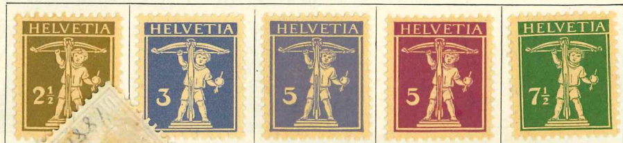
265 Lilac 266 269