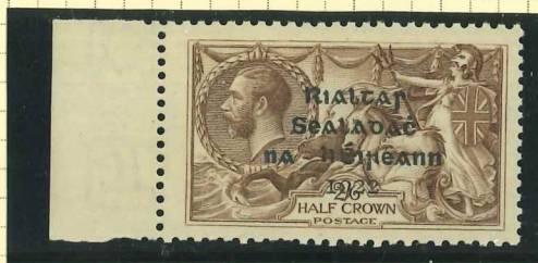
T12 (umm) Reddish - Brown Printer's plate 2/4R, with perfect 'R' in 'CROWN' Variety T12b - 'Brennan' re-entry (M4), stamp from R7/1