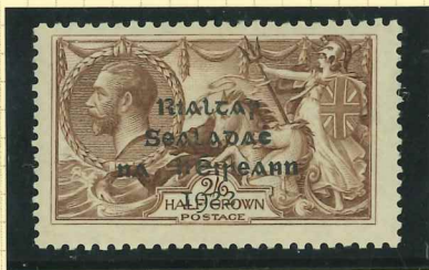
T12 (fm) Reddish - Brown (Shade variation) Printer's plate 2/4R, with perfect 'R' in 'CROWN' Variety T12a - 'Nissen' re-entry (M3), stamp from R1/3