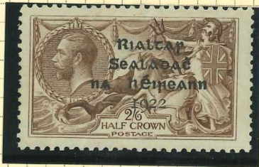
T12 (fm) Mid Reddish - Brown Printer's plate 2/4, with perfect 'R' in 'CROWN' Variety T12 / UF3e - 'A' of 'hA' with flaw above crossbar