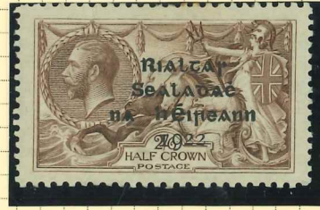
T12 (fm) Mid Reddish - Brown Printer's plate 2/4, with perfect 'R' in 'CROWN' Variety T12 / UF3e - 'A' of 'hA' blotted