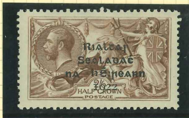
T12 (fm) Reddish - Brown Printer's plate 2/4R, with perfect 'R' in 'CROWN' Variety T12a - 'Nissen' re-entry (M3), stamp from R1/3