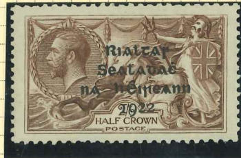
T12d(fm) Mid Reddish - Brown Short third line of overprint 21.00mm Printer's plate 2/4, with perfect 'R' in 'CROWN' Variety T12 / UF3e - 'A' of 'hEIREANN' blotted