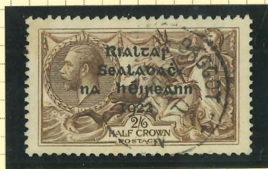
T12 (vfu) Printer's plate 2/4, with perfect 'R' in 'CROWN' Reddish - Brown cds Baggot, Dublin