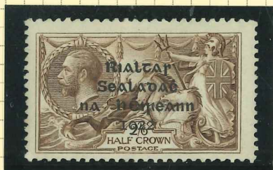
T12 (fm) Printer's plate 2/4, with perfect 'R' in 'CROWN' Reddish - Brown