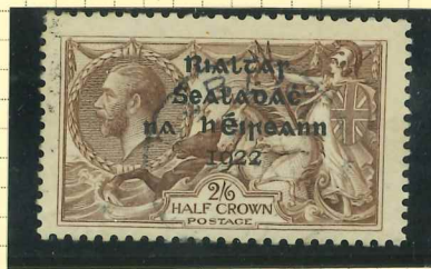
T12 (vfu) Printer's plate 2/4, with perfect 'R' in 'CROWN' Reddish - Brown