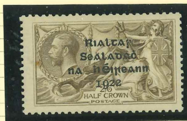
T12 (fm) Printer's plate 2/4, with perfect 'R' in 'CROWN' Pale Chocolate Brown