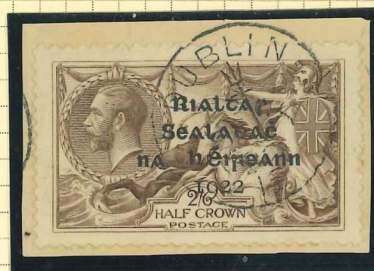
T12 (vfu) Printer's plate 2/4, with perfect 'R' in 'CROWN' Chocolate - Brown Shade cds DUBLIN