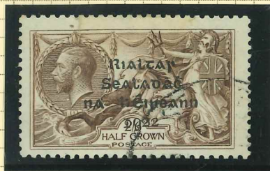
T12 (vfu) Printer's plate 2/4, with perfect 'R' in 'CROWN' Chocolate - Brown