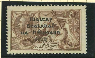
T12 (fm) Reddish - Brown Printer's Plate 2/4, with perfect 'R' in 'CROWN' Variety T12d - Short third line 21mm Stamp from either R1/4 or R6/4