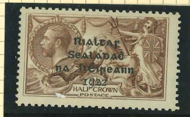
T12 (fm) Reddish - Brown Printer's Plate 2/4, with perfect 'R' in 'CROWN' Variety T12d - Short third line 21mm Stamp from either R1/4 or R6/4