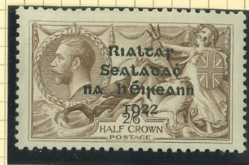
T12d (fm) Shade