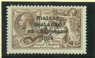
T12 (fm) Printer's plate 2/4, with perfect 'R' in 'CROWN' Chocolate Brown