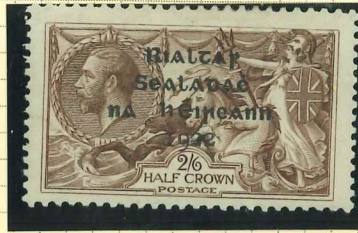
T12 (fm) Reddish - Brown Printer's plate 2/4, with perfect 'R' in 'CROWN' Variety T12 / UF3a - Blotted second 'A' of 'RIALTAIR'