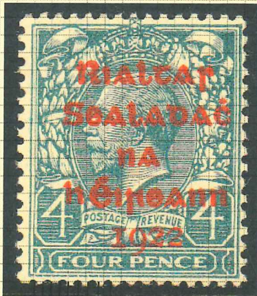
Nine Breaks under 'FOUR' Stage 1

T10b (fm) R5/12 Nine breaks under 'FOUR', Stage 1 Printer's Plate 1e Overprint Stereo Setting 1 + 3, Error from Stereo 3 Varieties V1d - R5/12 'R' over 'Se' and 'l' over right shank of 'n' in 'nA'