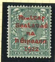
T10/F2a (fm) Broken 'ia' of 'Rialtas' Stamp from R1/5, Stereo Setting 2