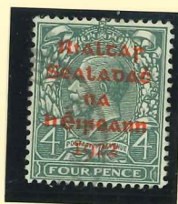
T10 (fu) Setting 1 e24