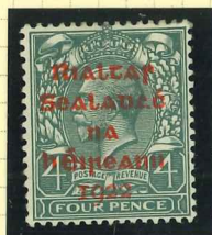
T10/ UF2w (fm)