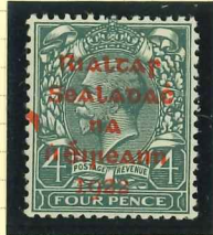
T10/ UF2s (umm)

R16/10 - Crescent flaw left of overprint third line and "n" for "h" in 'héireann'