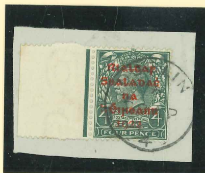
T10 (vfu) Setting 1 Dublin cancel 22/4/22 e30

Overprint Stereo Settings 2 or 1+3, with no misalignments