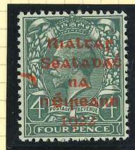
T10/ UF2s (umm)

R16/10 - Crescent flaw left of overprint third line and "n" for "h" in 'héireann'