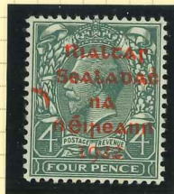
T10/ UF2s (umm)

R16/10 - Crescent flaw left of overprint third line and "n" for "h" in 'héireann'