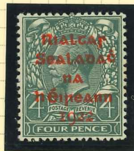
T10/V2i (umm) 'R' over 'Se' & raised 'c' of 'Sealadac'