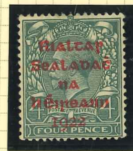
T10/V2m (fm) 'ei' over '1' in '1922'