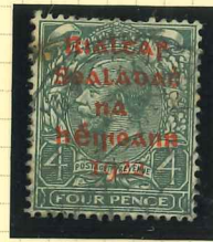
T10/V2c (fu) 'R' over 'Se' & 'l' over right shank of 'n' in 'nA'