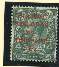
T10 (fu) Setting 1 e24