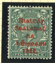
T10/V2l (fm) 'l' over left shank of 'n' in 'nA' & 'ei' over '1' in '1922'