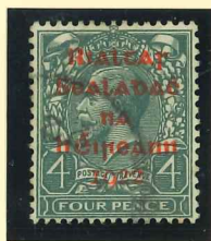
T10 (fu) Setting 1 e24