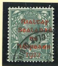
T10 (vfu) Setting 2 v1c e36