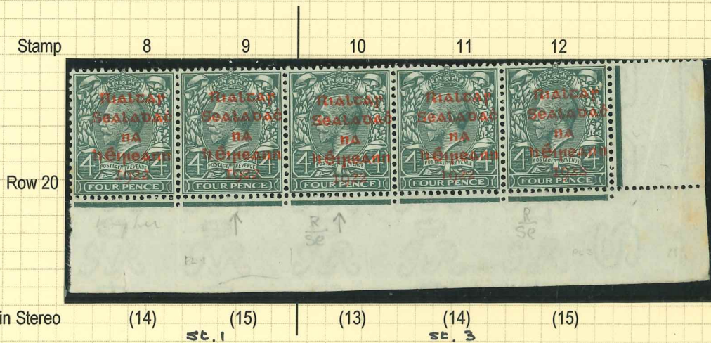
Stamp 8 9 10 11 12 Row 20 Position in Stereo (14) (15) | (13) (14) (15) St. 1 | St. 3