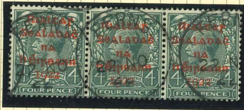
Stamp 1 2 3

RED OVERPRINT OUT OF ALIGNMENT PAIR (OAP)