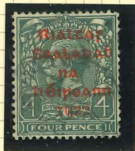
T10b (fu) + V2d