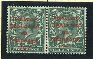
Stereo 1 | Stereo 3 Position 15 | Position 13