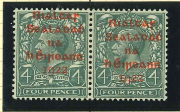
Stereo 1 | Stereo 3

RED OVERPRINT COMBINATION SETTING, STEREOS 1+3