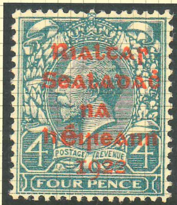
Ten Breaks under 'FOUR' Stage 2

V1d - R5/12 'R' over 'Se' and 'l' over right shank of 'n' in 'nA'