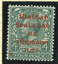
T10/ UF2b (umm)