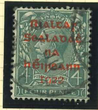
T10/V2a (fu) 'R' over 'Se'

Consistent variants from Stereo 3 (Composite setting 1+3)