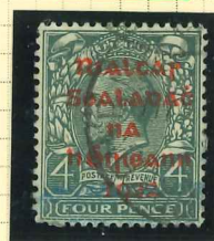
T10b (fu) + V2d