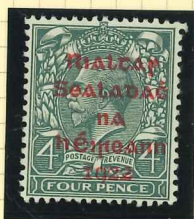
T10/F2n (fm) Broken tail to '9' in '1922'