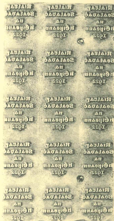
3 x 5 Stereo from Setting 1.

'R' over 'Se' occurs eight times in each stereo from setting 3, together with other alignment variants.