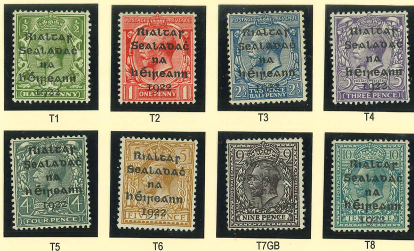
Examples all from Stereo Setting 1, with uniform settings