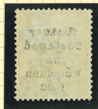
T6 / V1u Offset of overprint