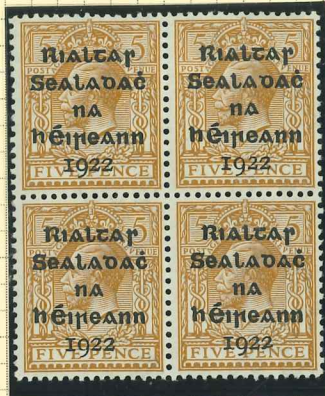
T6 (4x umm) €60