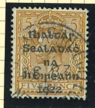
T6/F1s (fvu) Stereo Setting 2 Broken / Short tail to '9' of '1922' 'ei' over '1' of '1922'