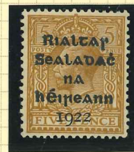
T6 / F1t (fm) Blotted second 'a' of 'Sealadac'