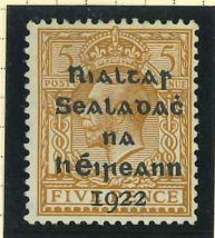
T6 (fm) €6