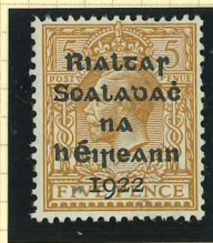
T6 / F1i (fm) 'o' for 'c' in 'Sealadac' DL2/B27