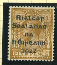
T6/UF1t (fm) Broken and damaged letters