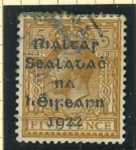
T6 (fu) €14