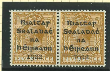
T6/F1e (fm) Stereo Setting 1 Misshapen 'L' - shortened and with cross stroke in 'Rialta' Curved damage also in tops of 'R'.