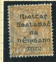
T6 (fu) €14