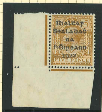
T6/F1s (umm) R20/1 Stereo Setting 2 Broken / Short tail to '9' of '1922' 'ei' over '1' of '1922'