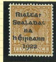
T6 / V1w (fm) Small 's' in 'Rialtas', raised 'c' in 'Sealadac' & 'R' over 'Se' DL5/H29