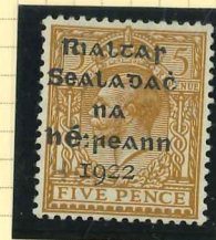
T6/UF1m (m) Colon for '1' of "héireann" Shade