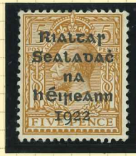
T6 / V1b (m) 'R' over 'Se' 'L' over left shank of 'n'.