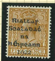
T6 (fm) Variety