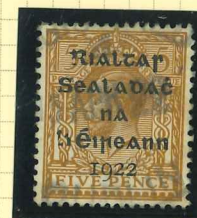
T6/UF1t (fu) Broken letters