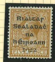
T6 (fm) Variety