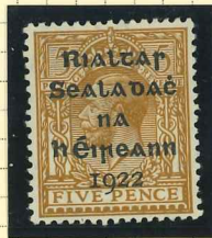
T6 (fm) €6