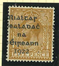
T6/UF1s (fm) Overprint shift to the left