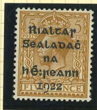
T6 (m) UF1m - Colon for 'l' of 'héireann' UF1t - broken '9' in '1922'