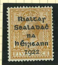
T6 (fm) Variety