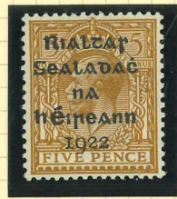
T6 / V1r (fm) Flat tail to '9' of '1922' DL5/02B