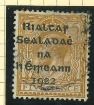
T6 (fu) Variety