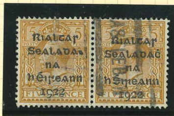
T6/OAP Setting 2 (fu) Left stamp V1f variety (characteristic of Setting 2) Left stamp UF1e Damaged "c" and no dot over "c" In "Sealadac"