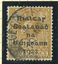
T6 (vfu) €15