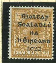
T6 (fm) Variety