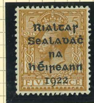
T6 (fm) €6