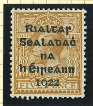
T6/F1s (fm) Stereo Setting 1 Broken/ Short tail to '9' of '1922'