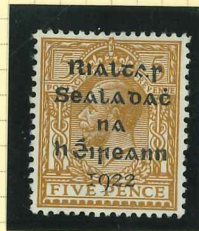
T6/UF1p (-fm) colon for '1' of '1922'