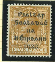
T6/UF1a (m) 'P' for 'R' of 'Rialtas'