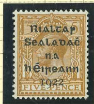
T6GB (fm) Grey black ink overprint