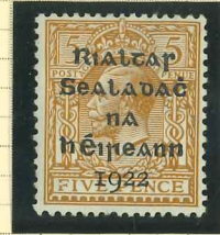
T6 (fm) €6