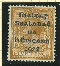
T6 (fm) Variety