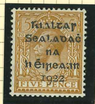
T6 (fm) Variety