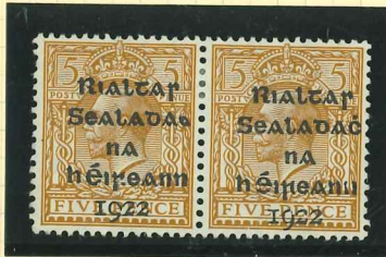
T6/OAP Setting 2 (vfm) Left stamp V1f variety (characteristic of Setting 2) Left stamp UF1e Damaged "c" and no dot over "c" In "Sealadac"