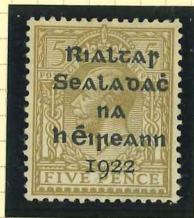
T6 (m) Bistre shade