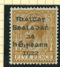
T6 (fm) Variety