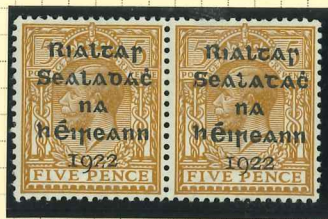
T6 (umm) Variety €60