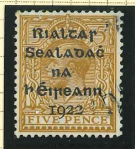
T6 (fu) Variety