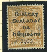
T6 (fu) €14