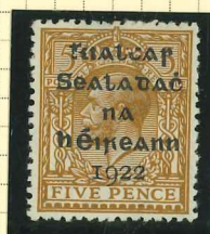
T6 (fm) Variety