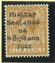
T6 / V1h (umm) Raised 'c' of 'Sealadac' & 'R' over 'Se' DL2H