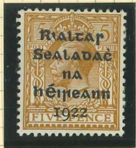
T6 (fm) €6