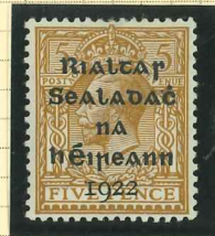
T6 (fm) €6