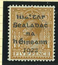
T6 (-fm) UF1t - Broken Letters in 'Rialtas'