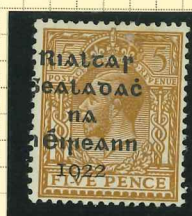
T6 (fm) Variety