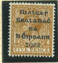
T6 (fm) €6