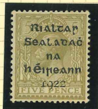
T6 (fm) Bistre shade Variety UF1t - Broken letters