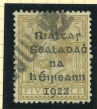
T6 (fu) Bistre shade