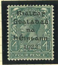
T5 (fm) Variety