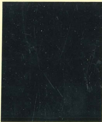
T5 Block (umm) T5c Variety

Broken crossbar to '4' - R19/4 (stamp top left) Printer's Plate 1e