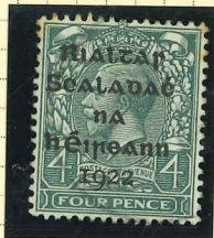
T5 ( u) Variety