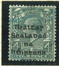
T5 ( vfu) Variety