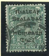
T5a (fu) Variety

Break in frame over 'O' in 'FOUR' - R19/2 Printer's Plate 1e