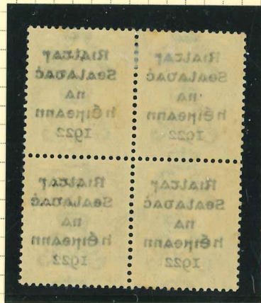
T5 ( 4x umm) Variety