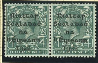
T5 (umm) Variety