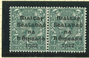
T5 (fm) Variety F1s - Broken tail to '9' of '1922' (RHS)