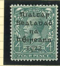
T5 (fm) Variety