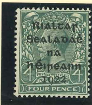
T5c Variety (fm)

Broken crossbar to '4' - R19/4 Printer's Plate 1e