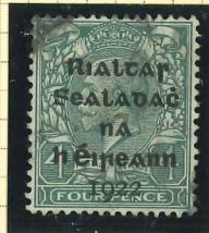
T5 (fu) Variety