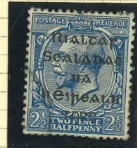
T3 (u) Variety