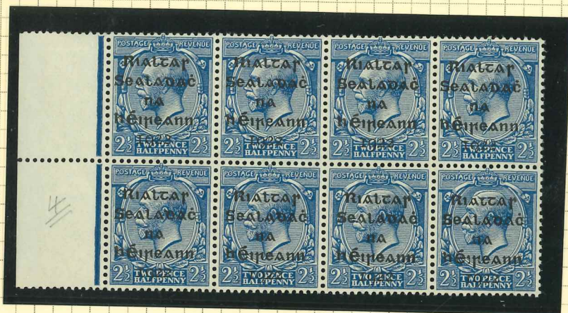
T3 (8x umm)