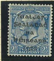
T3 (m) Variety