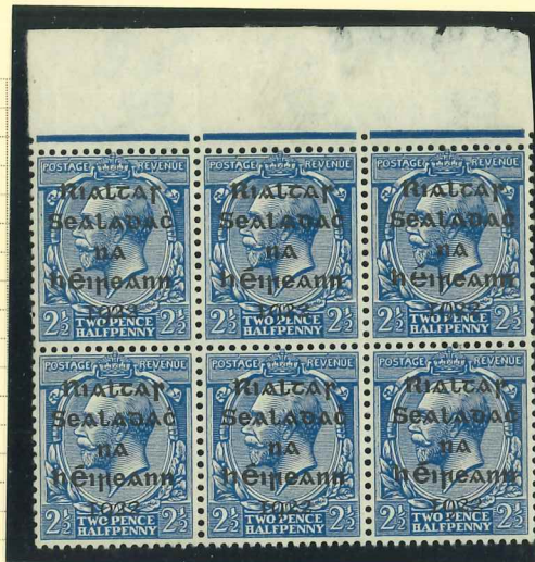
T3 (6x umm)