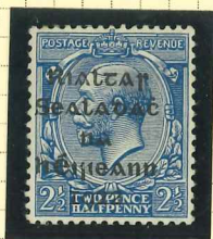
T3 (m) Variety