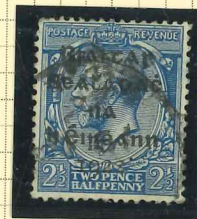
T3 (u) Variety