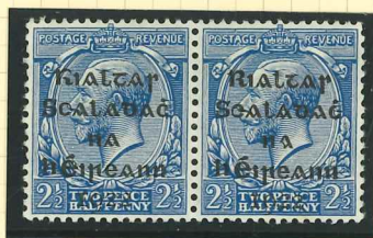
T3 pair, Setting 1 (umm) V1t - Left stamp "c" for "e" in "Sealadac" UF1t - both stamps with defective type