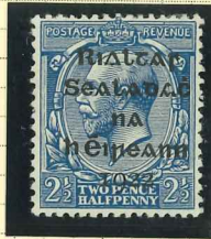
T3 (fm) Variety

UF1ba - No crossbar on first 'a' of 'RIALCAR'