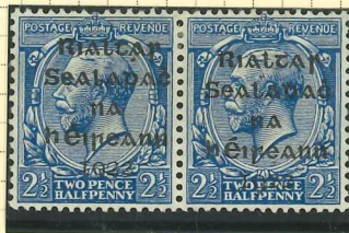
T3 (fm) Variety

UF1t - Dot under second 'a' of 'RIALCAR'