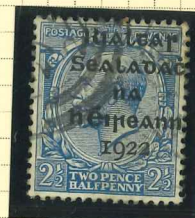
T3 (fu) Variety