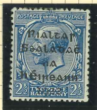
T3 (fm) Variety