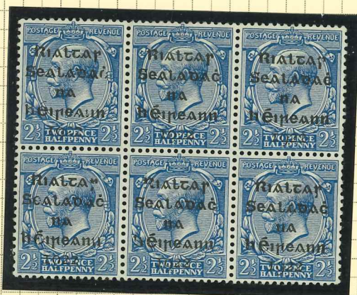
T3 (5x umm) Variety

UF1t - Multiple examples of broken and deformed overprint letters