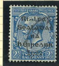
T3 (fu) Variety