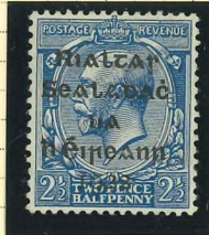
T3 (fm) Variety