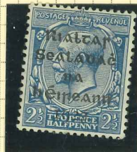
T3 GB (fm) Grey Black Overprint