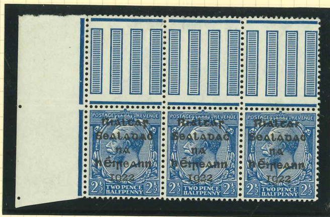
T3 Strip of three, from rare Setting 2 (umm) R11/1 T3/V1j (umm) "R" and "n" with diagonal cuts to left uprights R11/3 T3/V1h (umm) "R" over "Se" and raised "c" of "Sealadac"