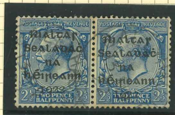
T3 / OAP (fu) Out of Alignment Pair Setting 1