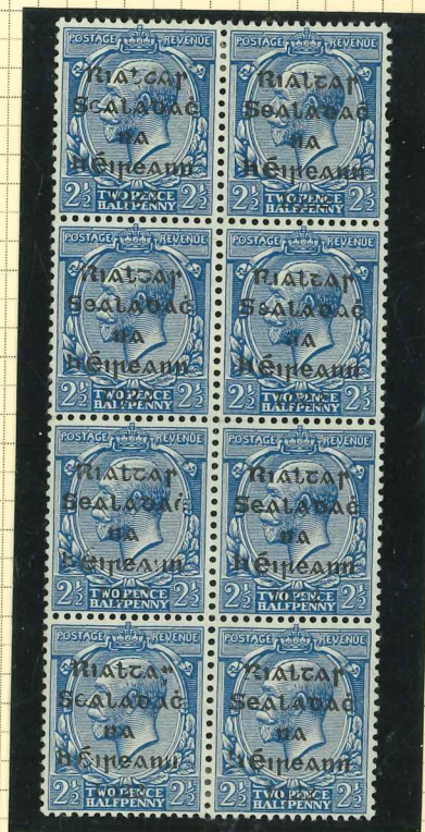
T3 (4x umm, 4x fm) Variety

UF1t - Multiple examples of broken and deformed overprint letters