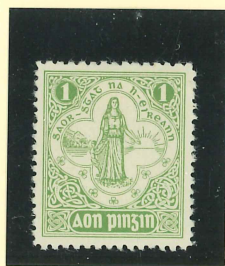
EP166 (fm) Emerald (pale green) Plate 1 - perforated essay