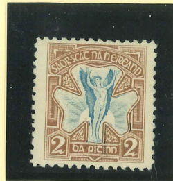
EH90 (fm) Blue / Orange Paid €120. Cat. 2