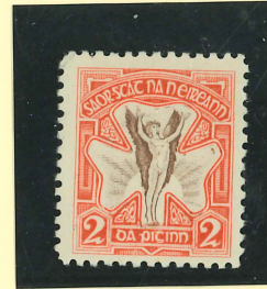
EH85 (fm) Brown / Red Paid €165. Cat. 2