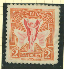
E80 (fm) Carmine / Orange