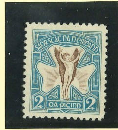
EH83 (fm) Brown / Blue Cat. 2