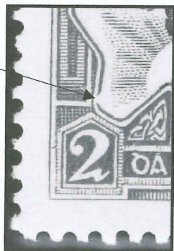
EH76e to EH96e fig. 45