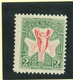
EH82 (fm) Carmine / Emerald Cat. 2