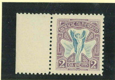
EH88 (fm) Blue / Mauve Cat. 2