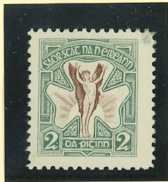
EH84 (fm) Brown / Dull Blue Green Paid €142. Cat. 2