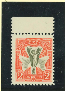
EH86 (umm) Green-Brown / Orange Paid €200. Cat. 1