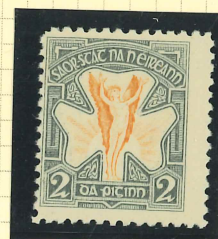
E77 (fm) Yellow-Orange / Grey