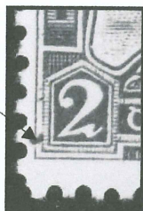
EH 76a to EH96a fig. 44

(a) Flaw between vertical frame-line and left value tablet, essay from Row 2, Essay 2 (R2/2), see fig. 44.