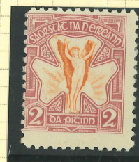
E79 (fm) Orange / Lake