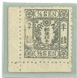
Plate 1 Pos. 33