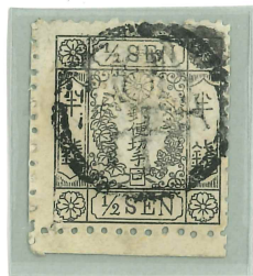
Plate 2 Pos. 33