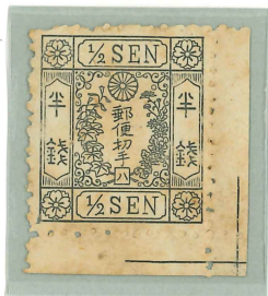
Plate 1 Pos. 40