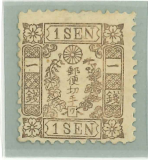
Syllabic 13 (wa)