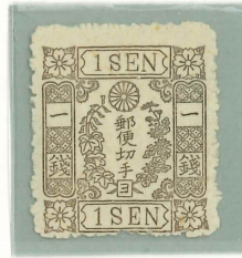
Syllabic 15 (yo)