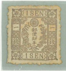
Syllabic 14 (ka)