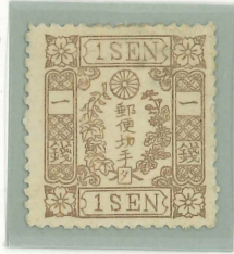
Syllabic 16 (ta)