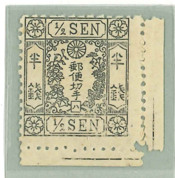
Plate 3 Pos. 40