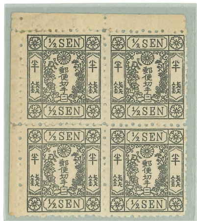
Plate 1 Pos. 1 2 9 10