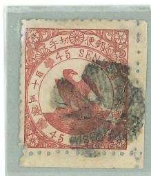
P. 11 Plate 2 Pos. 40