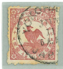
P. 11 Pos. 7