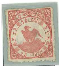
P. 11 Plate 1 Pos. 35