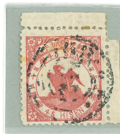
P. 125 Pos. 8