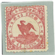
P. 125 Pos. 19