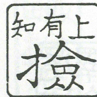
Fancy Cancellation KOZUCHI