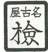
Fancy Cancellation NAGOYA