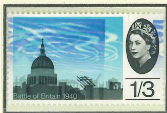
1s 3d Colour shift of blue towards left.