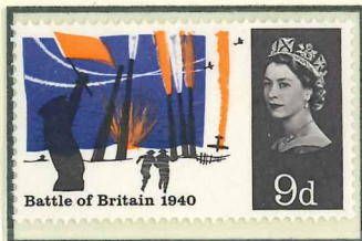
9d Colour shift of orange towards right causing the tail fin to be out of alignment