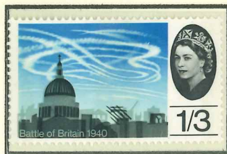
1s 3d Colour shift of blue causing a ghosting effect around the spire of St. Paul's Cathedral.