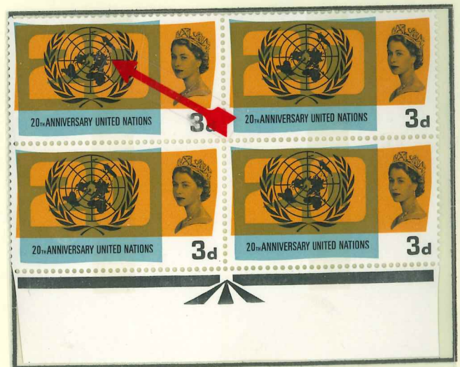
VARIETY- 3 d R 19/3 SG 681b Lake in Russia. Both Ordinary (Right) and Phosphor (Left) versions shown in blocks of 4.