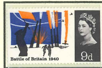
9d Normal Stamp