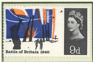
9d Colour shift of orange towards left causing the tail fin to be out of alignment