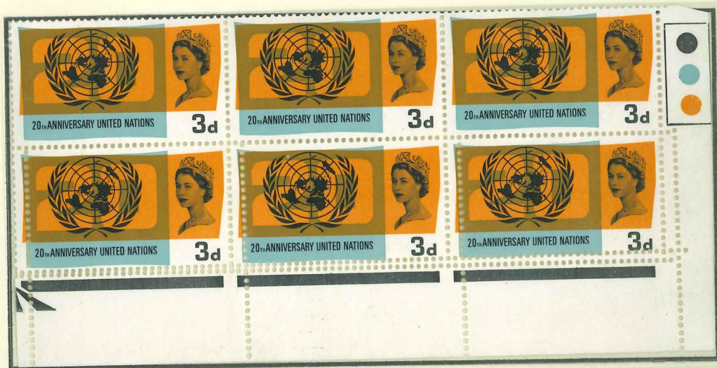
VARIETY- 3d Major misperforation causing double perforation at foot of block of six with traffic lights boxed in the margin.

Notes : The stamp was issued with and without phosphor.