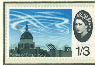
1s 3d Normal Stamp