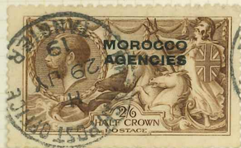
BPO TANGER 29 OCT 1919 STOTTEN TYPE TR-LC3H LATEST KNOWN DATE