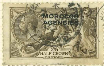
BPO TANGER 7-54-1922