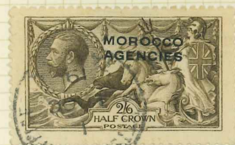
BPO TANGER 1 OCT 1919 STOTTEN TYPE TR-LC3I