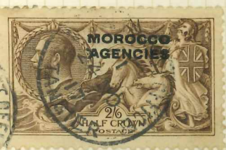
BPO TANGER 24 NO 1917 STOTTEN TYPE TR-LC3I