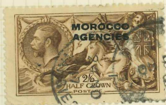
BPO TANGER 24 NO 1917 STOTTEN TYPE TR-LC3I