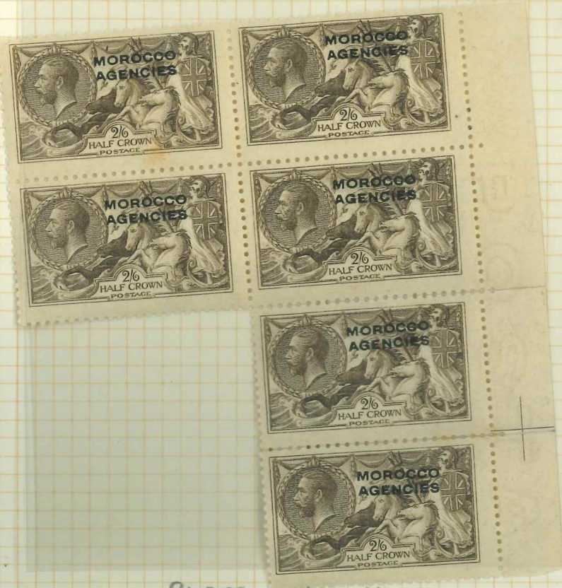
PLATE HV II

* PHILATELIC ALBUM LEAF NO. 3922 (FACED); NO. 3920 (UNFACED) STANLEY GIBBONS LTD. LONDON AND RINGWOOD MADE AND PRINTED IN ENGLAND - DR