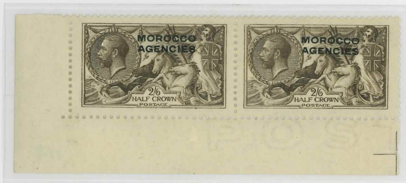
Ex Plate HV1

Examples showing the use of the ex Waterlow plates but being from the De La Rue printings the bottom margin is imperforate