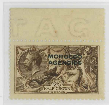
Deep Yellow Brown