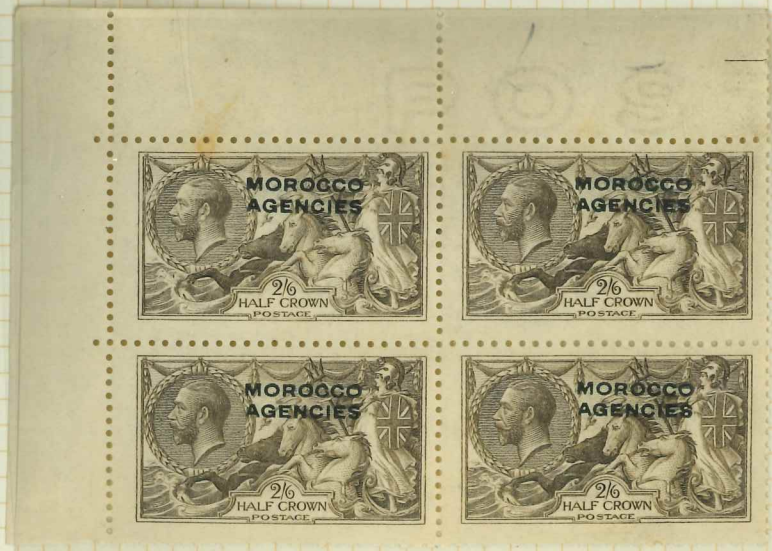
PLATE HV II