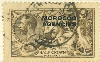
BPO SAKA 18 SA 1924 STOTTEN TYPE SI-1