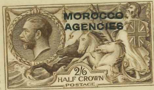
DEEP-YELLO w BROWN