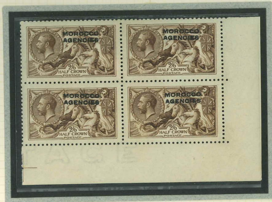
PLATE IV 3 ROWS 910 COLS 304