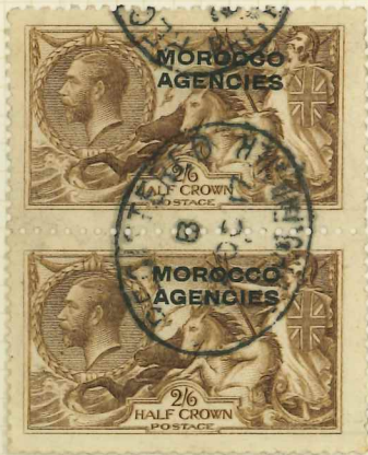
TANANARIVE 2 OCT 1917 STOTTEN TYPE TR-R13