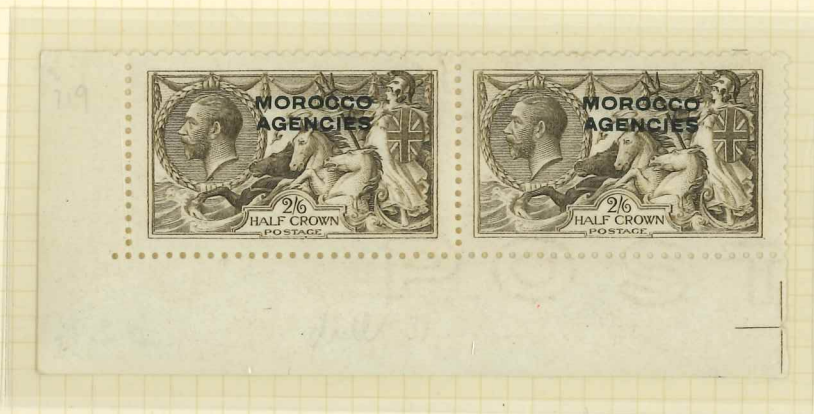
PLATE HV12 ROW 10 COLS 18 2