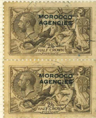
CASA BLANCA 5 DE 28 STOTTEN TYPE CA-3