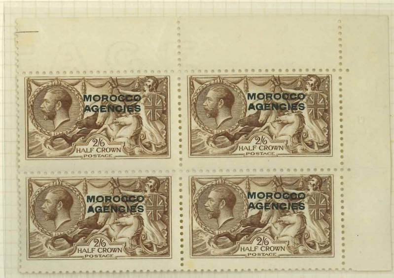
PLATE IV-3 ROWS 182 COLS 204