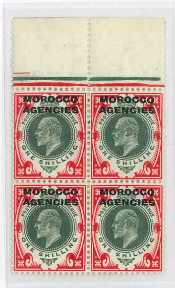
Head Plate 2 Border Plate 3 Rows 1 & 2 Columns 7 & 8