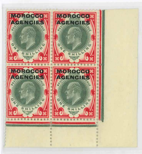
Head Plate 2 Border Plate 3 Rows 9 & 10 Columns 11 & 12 Border plate rules cut at corner