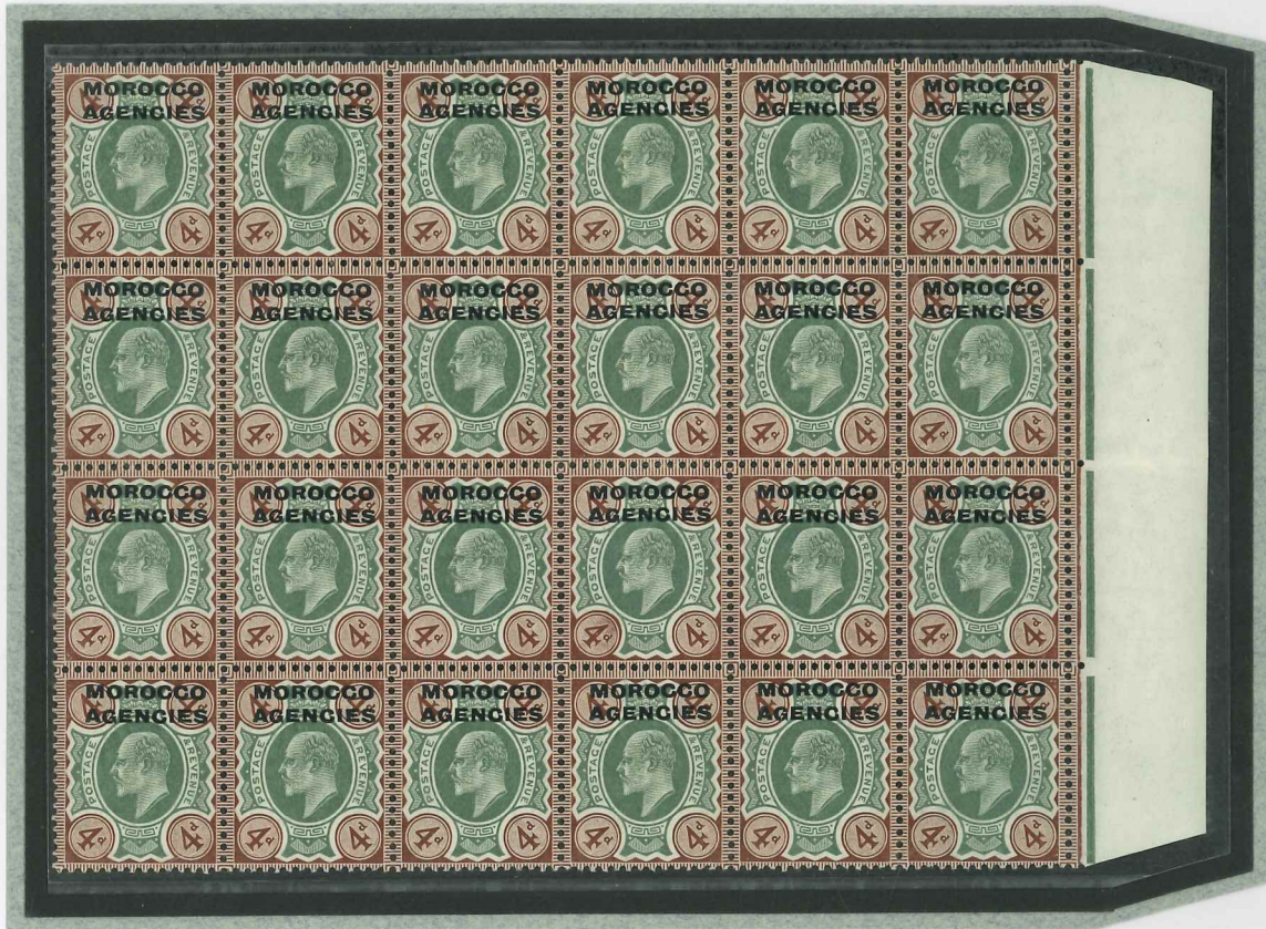
Head Plate 4 Duty Plate 5 Rows 15 – 18 Columns 7-12 Perforation Type H1 Left Sheet