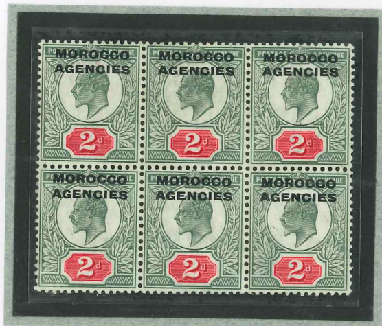
Head Plate 4 Duty Plate 4 Rows 15 & 16 Columns 7, 8 & 9 Deep dull green and carmine