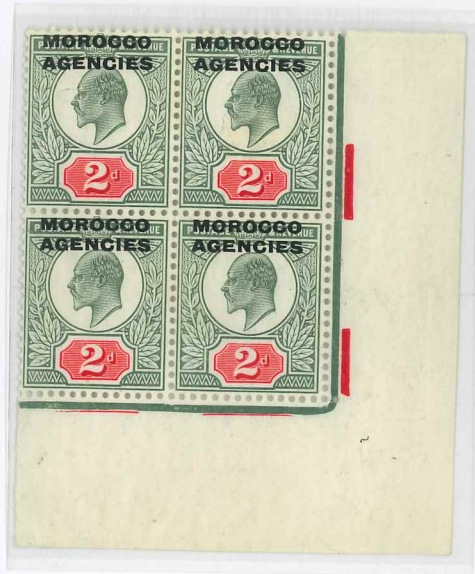
Head Plate 1 Duty Plate 3 Rows 19 & 20 Columns 11 & 12 Right Sheet 5 th printing