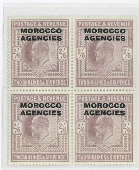
Pale Dull Purple