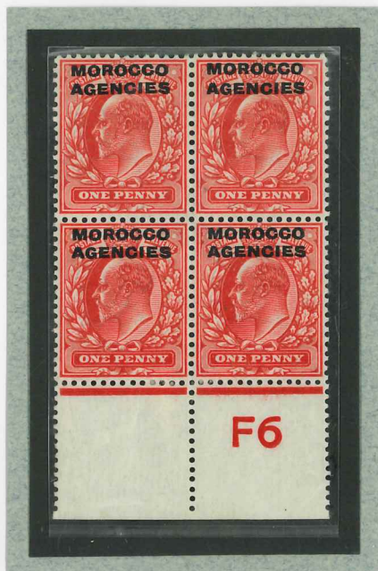
Both blocks plate 42 Perforation type V2