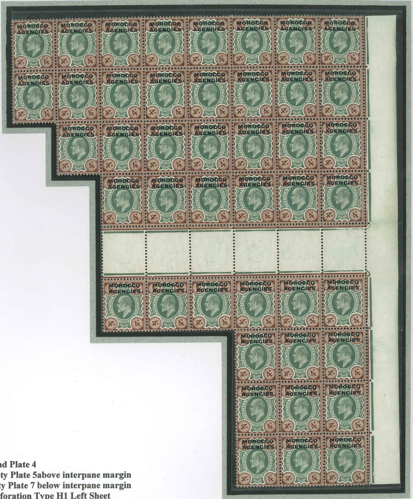
Head Plate 4 Duty Plate 5 above interpane margin Duty Plate 7 below interpane margin Perforation Type H1 Left Sheet