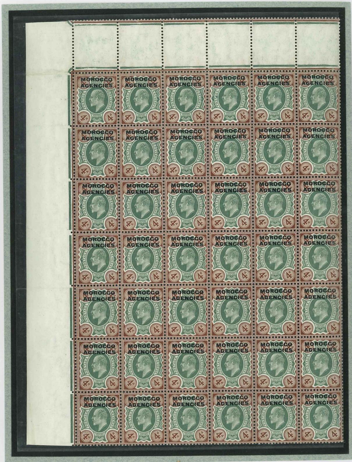
Head Plate 4 Duty Plate 5 Perforation Type H1 Left Sheet Rows 11 -17 Columns 1-6