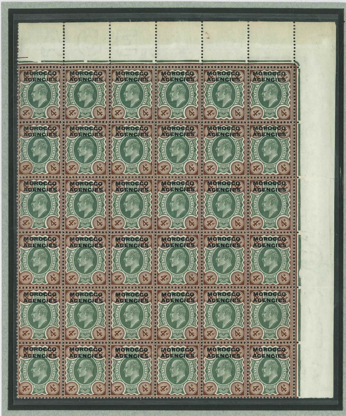
Head Plate 4 Duty Plate 7 Perforation Type H1 Left Sheet Rows 1 – 6 Columns 7-12

Row 3 Stamp 8 “damaged 4 in South west corner (SG Spec M24(c))