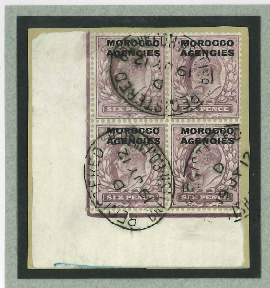
Plate 1A Perforation Type H1 Cancelled Tangier 19 JY 1912 Stotter Type TR-R1D

A total of 145 sheets (34,800 stamps) were produced from 3 warrants