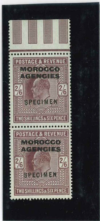
Somerset House printing Overprinted Specimen, type 22 for internal Post office use