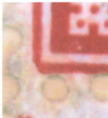
Damaged South West corner Row 10 Stamp 1

Head plate 2 Border Plate 3 Rows 7 to 10 Columns 1 & 2 Ex BPO Tangier 14 NO 1912 Stotter type TR-R1C