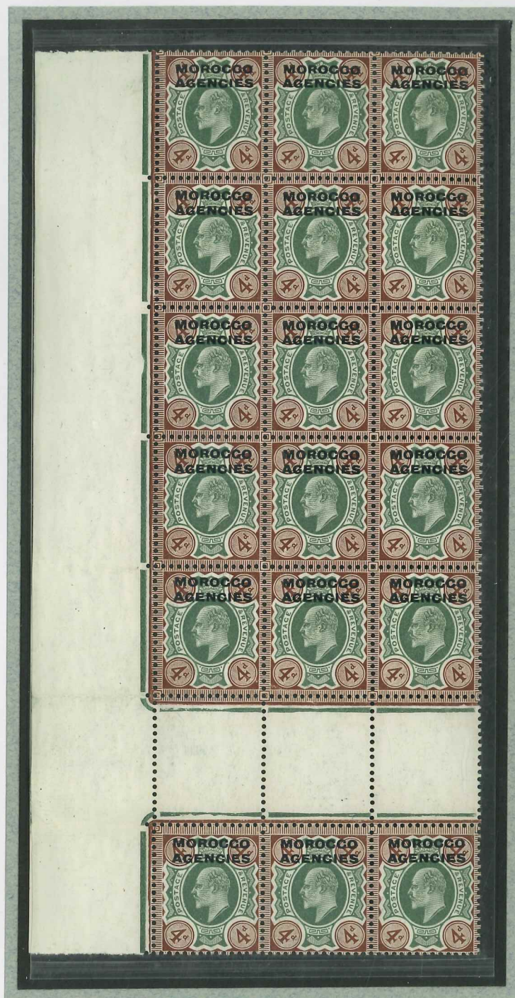
Head Plate 4 Duty Plate 5 above interpane margin Duty Plate 7 below interpane margin Perforation Type H1 Left Sheet