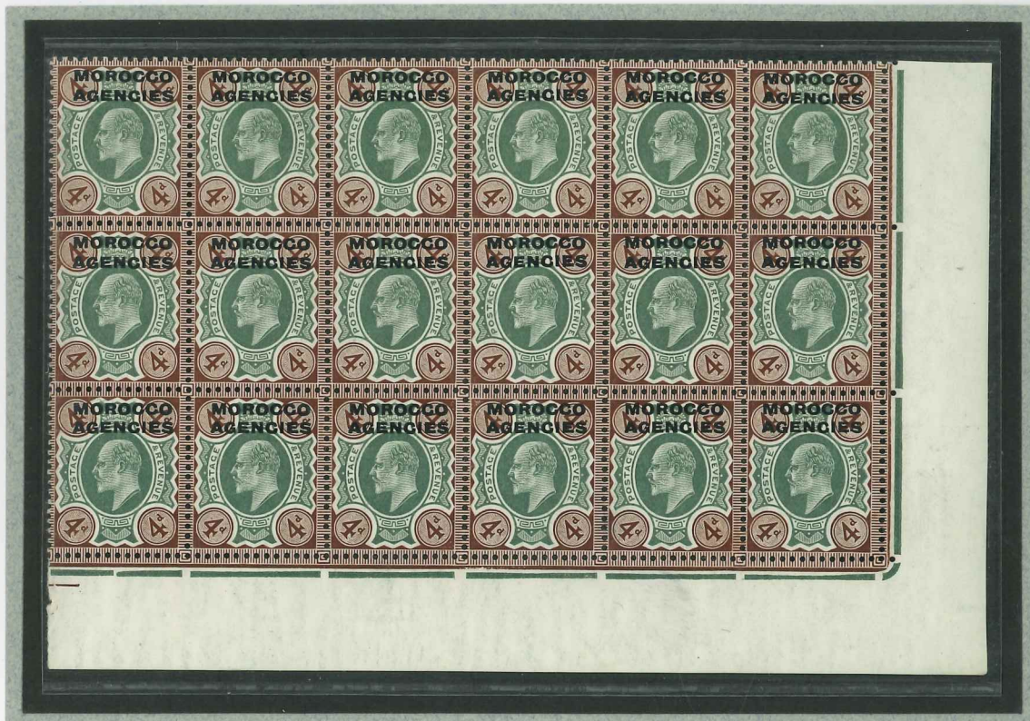
Head Plate 4 Duty Plate 5 Perforation Type H1 Left Sheet Rows 18-20 Columns 7-12