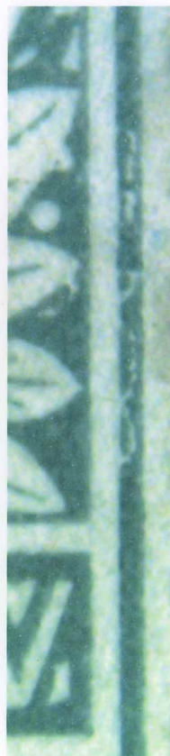
Head Plate 1 Duty Plate 3 Rows 17 & 18 Columns 6 & 7 Major Right frame line cracks Row 18 Column 7