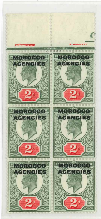
Head Plate 1 Duty Plate 3 Rows 1- 3 Columns 5 & 6 Row 2 Column 6 Scratch in left zig zag