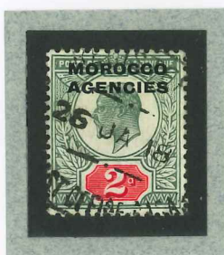
Duty Plate 4 Row 8 Column 4 Broken line in Duty Tablet Ex BPO Casablanca 26 JA 1918 Stotter type CA-8