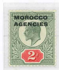
Head Plate 1 Duty Plate 3 Row 18 Column 12

This cracked plate variety is listed in SG Spec as M12(i) with a description of "crack beside O stronger". This description is somewhat misleading as the crack extends through the "O" of "Postage" down the entire length of the stamp with the bottom frame line also broken.