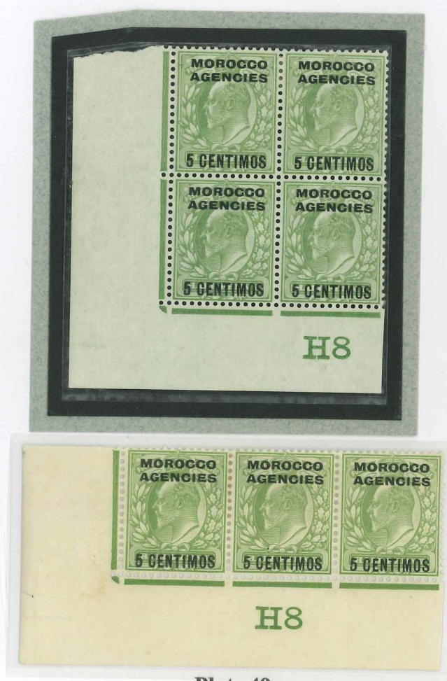
Plate 49a Perforation type H1