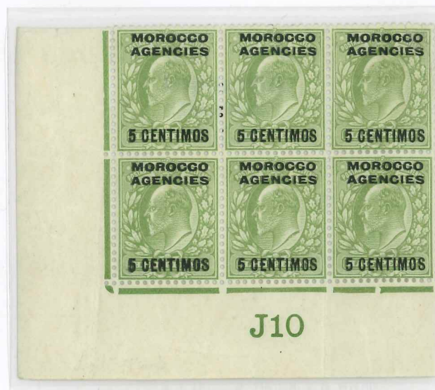
Control J10 in use October 1910 Plate 43c Left Sheet Perforation type H1