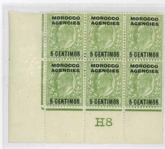
Plate 52A Perforation type V2