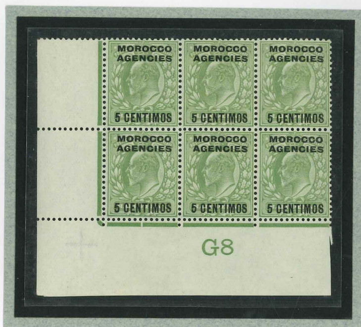
Plate 28 Perforation type V2A