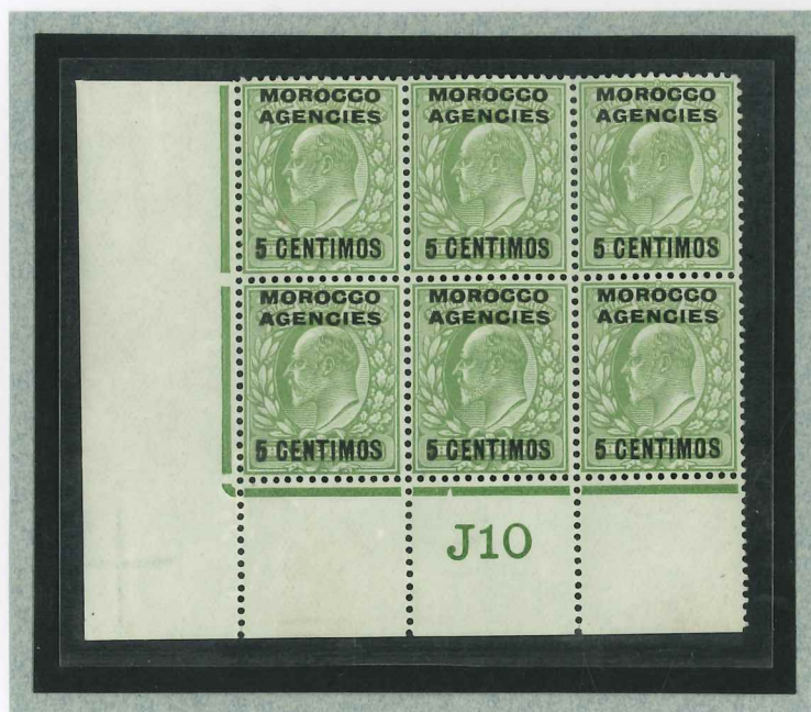
Plate 41B Perforation type V2