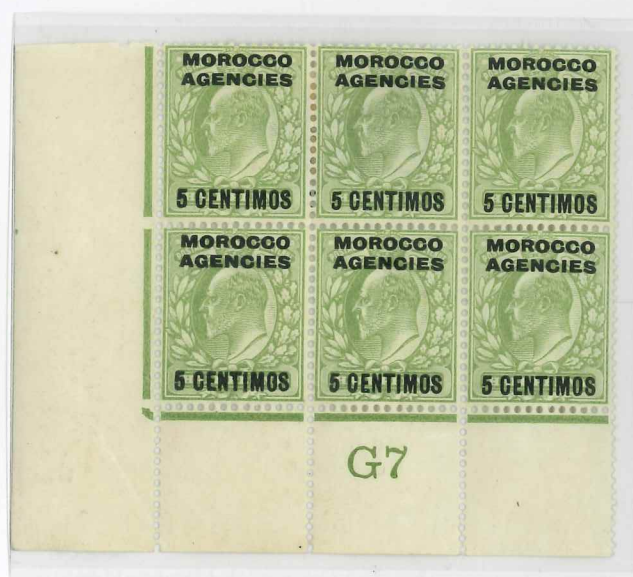
Plate 68 Perforation type V2