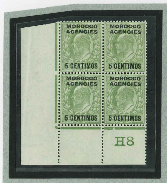
Plate 41B Perforation type V2