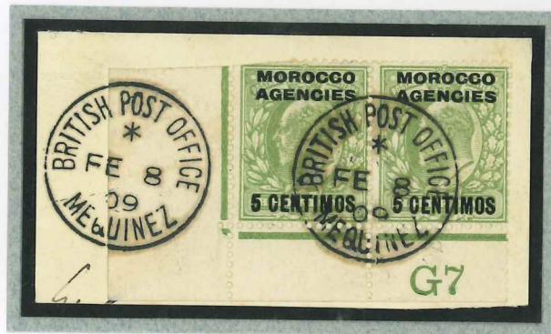
Plate 42 Perforation type H1 Ex BPO Mequinez FE 8 1909 Stotter type MZ-1b