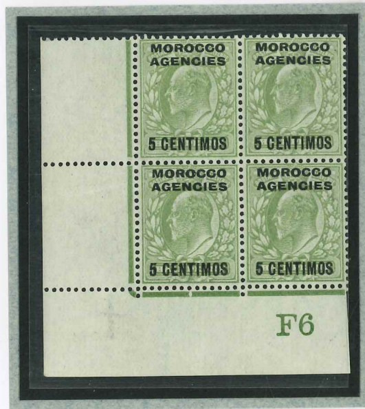
Plate 28 Perforation type V2A