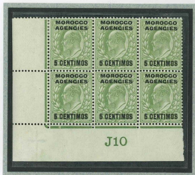
Plate 58A Perforation type V2A