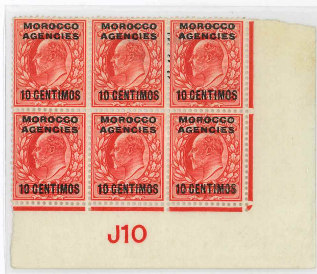
Control J10 in Use September 1910 Plate 62a Left Sheet Perforation Type V2a