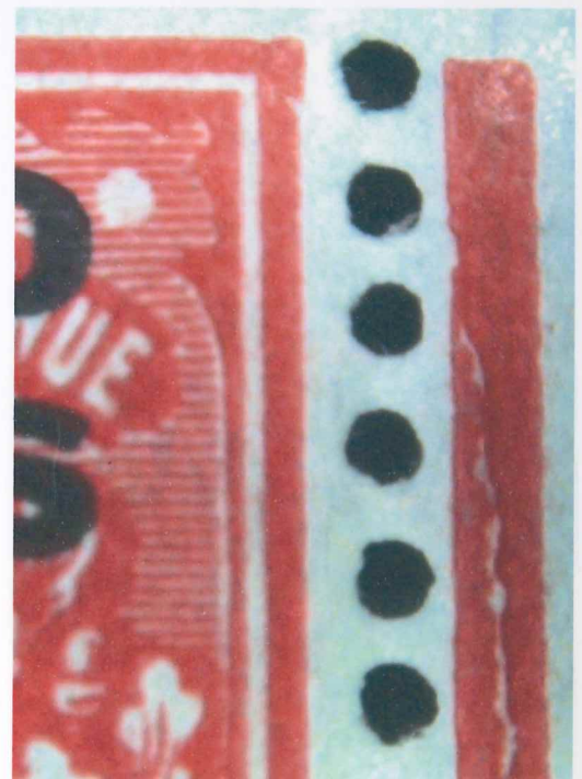
The crack in the jubilee line alongside rows 9 & 10 extends into the top right corner of Row 9 Column 12

Ex Head Plate 9 (only known with Control F6) Rows 6-10 Columns 11-12 Right Sheet.