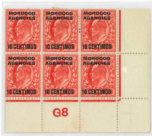
Control G8 in Use July 1908 Plate 46 Right Sheet Perforation type V2

This is the only plate known with Control G8