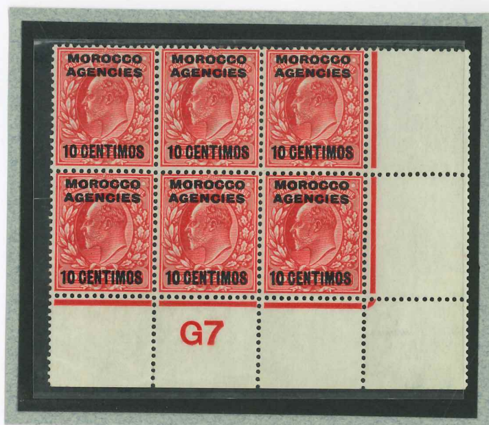
Control G7 in Use October 1907 Plate 42 Right Sheet Perforation Type V2