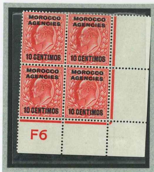
Control F6 in Use September 1906 Plate 42 Right Sheet Perforation Type V2