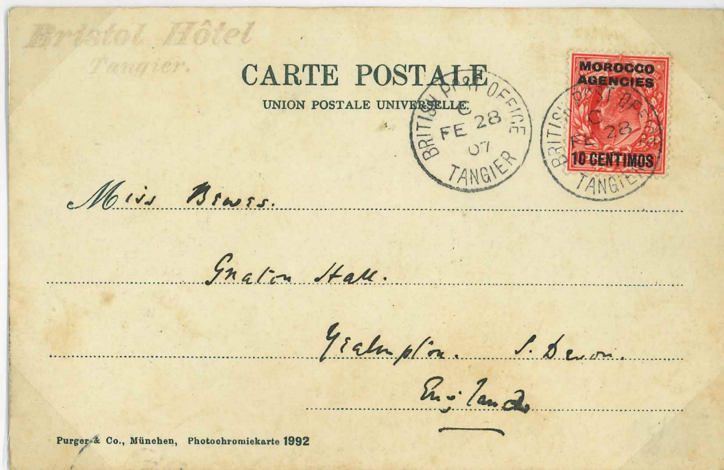
Ex BPO Tangier FE 28 1907 Stotter Type TR-LC1C With "Bristol Hotel Tangier" cachet Stotter Type BRH-1 One of 2 known examples from the same correspondence.