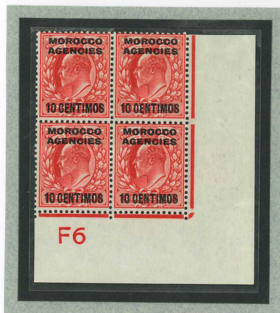
Control F6 in Use September 1906 Plate 43a Left Sheet Perforation Type V2a; right feed.