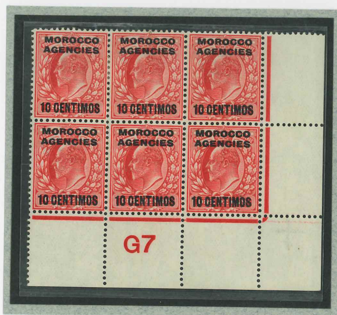
Control G7 in Use October 1907 Plate 36 Right Sheet Perforation Type V2