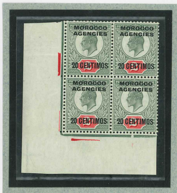
Ex Head Plate 1 Duty Plate 3