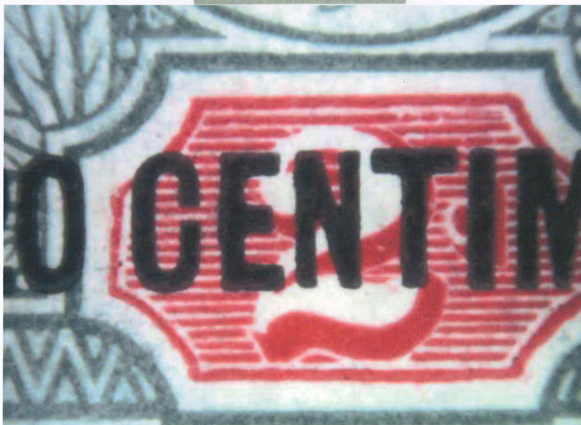
Ex Head Plate 2 Duty Plate 3 Rows 1 & 2 Columns 1 & 2 Row 1 Column 1 "Rhombus Flaw" S.G. Spec M12(b)