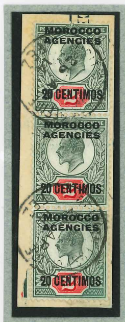
Ex BPO Fez 26 MR 1914 Stotter Type FZ-1 (latest recorded date of use)

A very small part of the left side margin visible on the bottom stamp clearly shows the Head Plate rule (in green) is broken – a co-extensive rule, one not extending past the edge of the stamp frame. Only Head Plate 4 is recorded on the underlying stamp with a co-extensive marginal rule. This fragment of the left side margin proves the use of Head Plate 4. The underlying stamp Head Plate 4 was only used with Duty Plate 4.