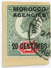
Head Plate 4 Duty Plate 4 Row 14 Column 8