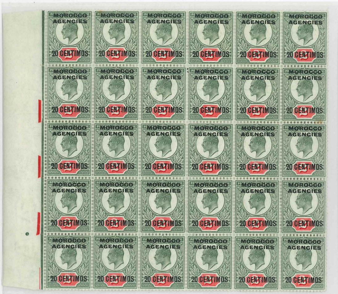
Ex Head Plate 2 Duty Plate 3 Right Sheet.