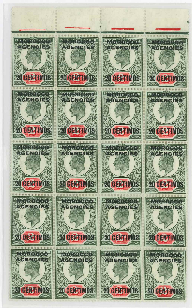
Ex Head Plate 2 Duty Plate 3 Rows 1-5 Columns 2-5 Right Sheet.