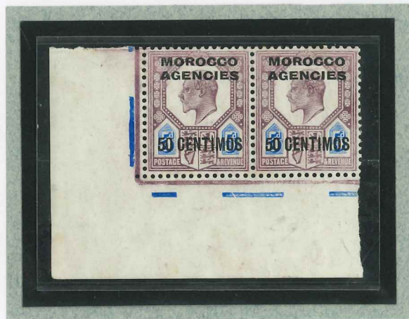
Head Plate 3 Duty Plate 3 Right Sheet