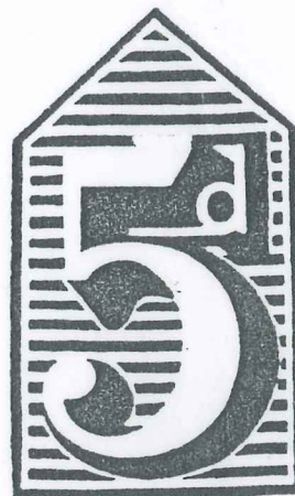
Constant & Unique Break in line above 5 Right Side Duty Plate Row 8 Column 8