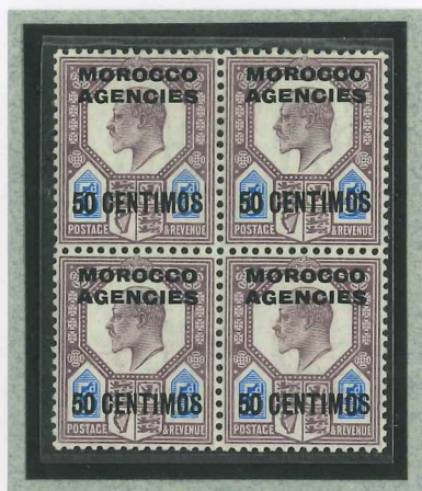
Ex Head Plate 2 Duty Plate 4 Rows 3 & 4 Columns 7 & 8