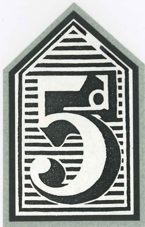
Ex Duty Plate 4 Row 5 Column 8

Broken left hand duty tablet at north-east diagonal arm.