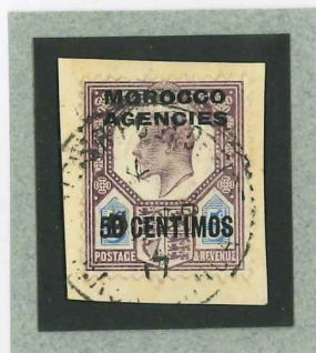
BPO Casablanca 4 SP 1917 Stotter Type CA-2