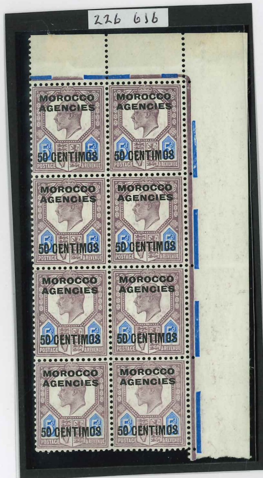
Ex Head Plate 3 Duty Plate 3 Upper Pane Right Sheet. Broken crown Row 1/12 S.G Spec M29b