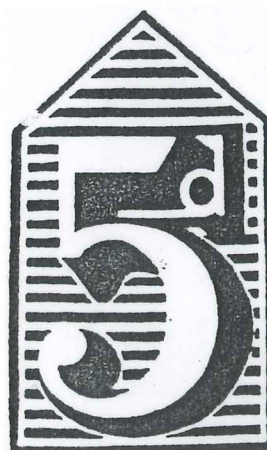
Constant & Unique Break in left side sloping frame Right side Duty Plate Row 10 Column 3