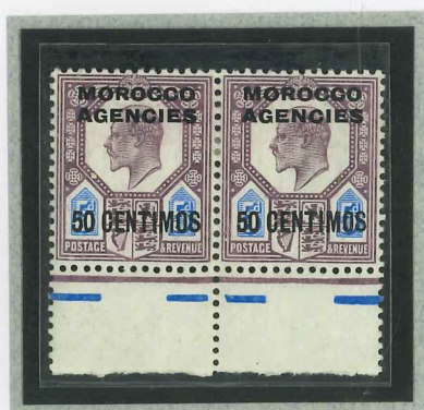
Ex Head Plate 2 Duty Plate 4 Row 10 Columns 3 & 4