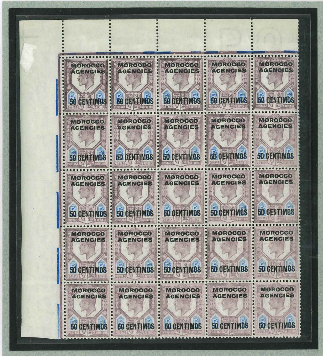
Head Plate 3 Duty Plate 3 Right Sheet Ex Count Exellmans