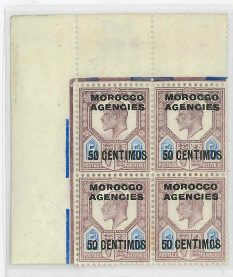
Ex Head Plate 2 Duty Plate 4 Upper Pane Left Sheet. Very Short Duty Plate Rule above Row 1/1.