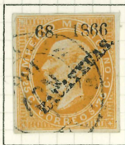
USED IN ZACATECAS.