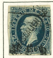
13c OPTD AGUASCALIENTES SUB-NUMBER 56-1866.