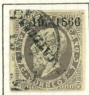
7c LILAC GREY, 1400 SENT, USED ZACATECAS.