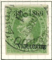
50c. NOTE THE THREE SHADES.