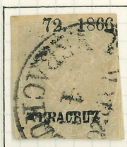
7c, USED MARCH 4, 1867.

7c IN THE DISTINCTIVE PALE SHADE OF THIS INVOICE. STRIP OF THREE USED JANUARY 16, 1867.