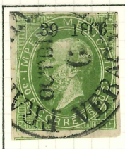
50c DEEP GREEN 3500 SENT.