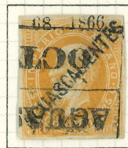
DIAGONAL AGUASCALIENTES SUB DISTRICT, SUB # 70.