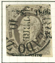
7c, DEEP LILAC GREY. 280, FOUR SHEETS, SENT.

AUGUST 14, 1866. COVER TO OAXACA WITH 25c TIED 'FRANQUEADO/VERA CRUZ' CDS.