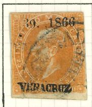
25c BROWN. NOTE THE THREE DISTINCT SHADES SENT.

SEPTEMBER 25, 1866. COVER TO MEXICO CITY WITH 25c TIED BY 'FRANQUEADO VERA CRUZ' CIRCULAR DATE STAMP. ONLY 25 AND 50c VALUES INVOICED.