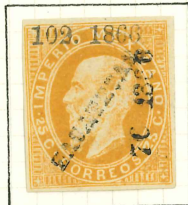
25c, SUB-NO 76-1866, NOT ALLOCATED, UNUSED.