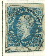
ON REVERSE: 'LIGNE B / PAQ. FR. NO. 2' IN BLACK.

SEPTEMBER 13, 1866. COVER TO BORDEAUX, FRANCE; WITH 13c TIED BY 'FRANQUEADO VERA CRUZ' DATESTAMP PAYING INTERNAL RATE, CARRIED DIRECT TO BORDEAUX, WHERE CHARGED '10' DECIMES DUE ON DELIVERY. THE MAXIMILIAN ISSUE IS VERY SELDOM FOUND ON MAIL OVERSEAS. JOURNEY TIME 28 DAYS. THE 13c WAS THE ONLY VALUE INVOICED ON THIS CONSIGNMENT.