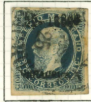
13c, DEEP BLUE, 1050 SENT. INVOICE NUMBER & DISTRICT NAME BOTH DOUBLY PRINTED.