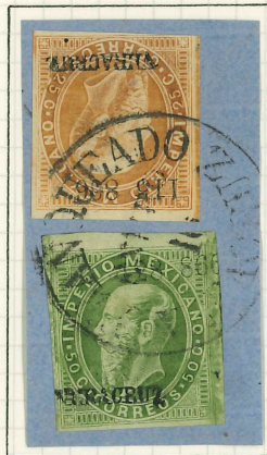
25c ON PIECE WITH 50c FROM INVOICE 128.