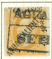
DIAGONAL AGUASCALIENTES SUB DISTRICT, SUB # 30.

NOVEMBER 5, 1866. COVER TO ZACATECAS WITH 25c TIED BY UNFRAMED 'FRANCO EN/ SOMBRERETE' HANDSTAMP. THE 25c WAS THE ONLY VALUE INVOICED.