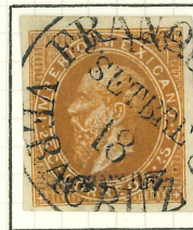
25c VERY DEEP BROWN.