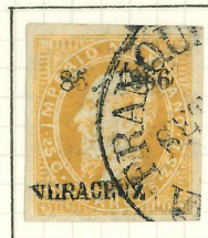
25c WAS THE ONLY VALUE SENT.