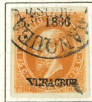
25c, POSITION 51, WITH 'MEXICANO' FOR 'MEX..'