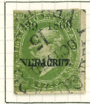
50c DOUBLY PRINTED. POSITION 46, PLATE II.