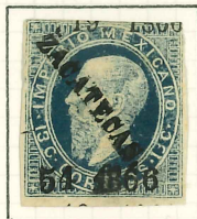
13c DEEP BLUE UNUSED, SUB-CONSIGNMENT 54- 1866 TO SOMBRERETE. 1400 SENT.