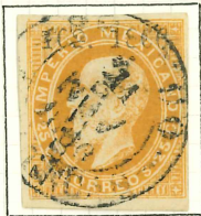
25c USED ZACATECAS.