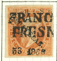
25c RED ORANGE, 4200 SENT, SUB '53- 1866' USED FRESHILLO.

13c DEEP BLUE, LITHO. CONSIGNED: AUGUST 7, 1866. INVOICE NO: 19. NO. SENT: 1,400.