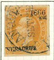
25c, POSITION 5, FLAW IN N.W. CORNER.