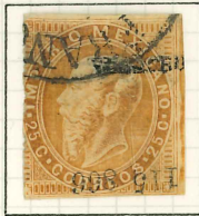
INVOICE NUMBER * DATE INVERTED AT FOOT.

SEPTEMBER 13, 1866. COVER TO BORDEAUX, FRANCE; WITH 13c TIED BY 'FRANQUEADO VERA CRUZ' DATESTAMP PAYING INTERNAL RATE, CARRIED DIRECT TO BORDEAUX, WHERE CHARGED '10' DECIMES DUE ON DELIVERY. THE MAXIMILIAN ISSUE IS VERY SELDOM FOUND ON MAIL OVERSEAS. JOURNEY TIME 28 DAYS. THE 13c WAS THE ONLY VALUE INVOICED ON THIS CONSIGNMENT.