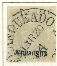
7c, USED MARCH 4, 1867.