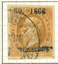
25c BROWN, PLATE I, 3500 SENT. ONLY TWO VALUES INVOICED