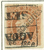
25c, OPTD AGUASCALIENTES SUB-NUMBER 56-1866.