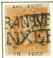
25c, SUB NUMBER 63- 1866 USED AT XEREZ.