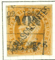
25c, OVERPRINTED 'AGUASCALIENTES' SUB NO. 75-1866.