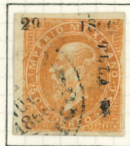
25c ORANGE RED USED WITH NOVEMBER 1866 MEXICO CITY CDS.