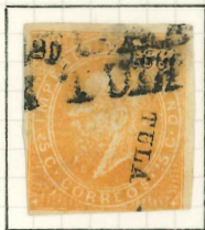
25c ORANGE BUFF, PLATE I, 1400 SENT, USED IN TULA.

SEPTEMBER 21, 1866. COVER TO MEXICO CITY WITH 13c WITHOUT DISTRICT NAME TIED BY 'FRANQUEA/DO EN TULA' HANDSTAMP. THE STAMP IS POSITION 19: TRIANGLE IN BETWEEN 'XI' OF 'MEXICANO'.