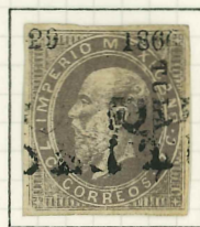
7c DEEP LILAC GREY, 350 SENT, USED IN TULA.