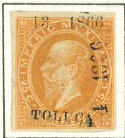
25c, SUB-NUMBER 4, TO TIANGUISTENGO. 4200 SENT ON INV.13.