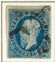
DISTRICT NAME READS UP AT RIGHT.

OCTOBER 24, 1866. COVER TO MEXICO CITY WITH 13c USED AS A SEAL ON REVERSE CANCELLED 'FRANCO-TOLUCA'. MEXICO ARRIVAL DATESTAMP ALONGSIDE. THE 13c WAS THE ONLY VALUE INVOICED, MOST MAIL BEING TO MEXICO CITY.