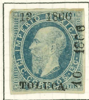
13c, SUB-NUMBER 10, UNALLOCATED, ONLY KNOWN USED IN MEXICO CITY.