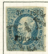
DISTRICT NAME INVERTED.