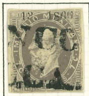
7c LILAC GREY, 210 SENT.