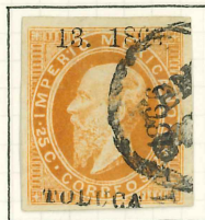
25c, SUB-NUMBER 14, TO TENANCIINGO.