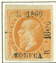
25c, SUB-NUMBER 8, TO TEJUPILCO.