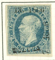
13c SUB-NUMBER 7, TO TESCALTITLAN.