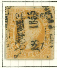
25c, SUB-CONSIGNMENT #27 TO SALINAS DEL PENON BLANCO.