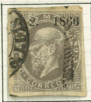
7c USED IN SAN LUIS POTOSI - '2' FOR '12' VARIETY IN INVOICE.