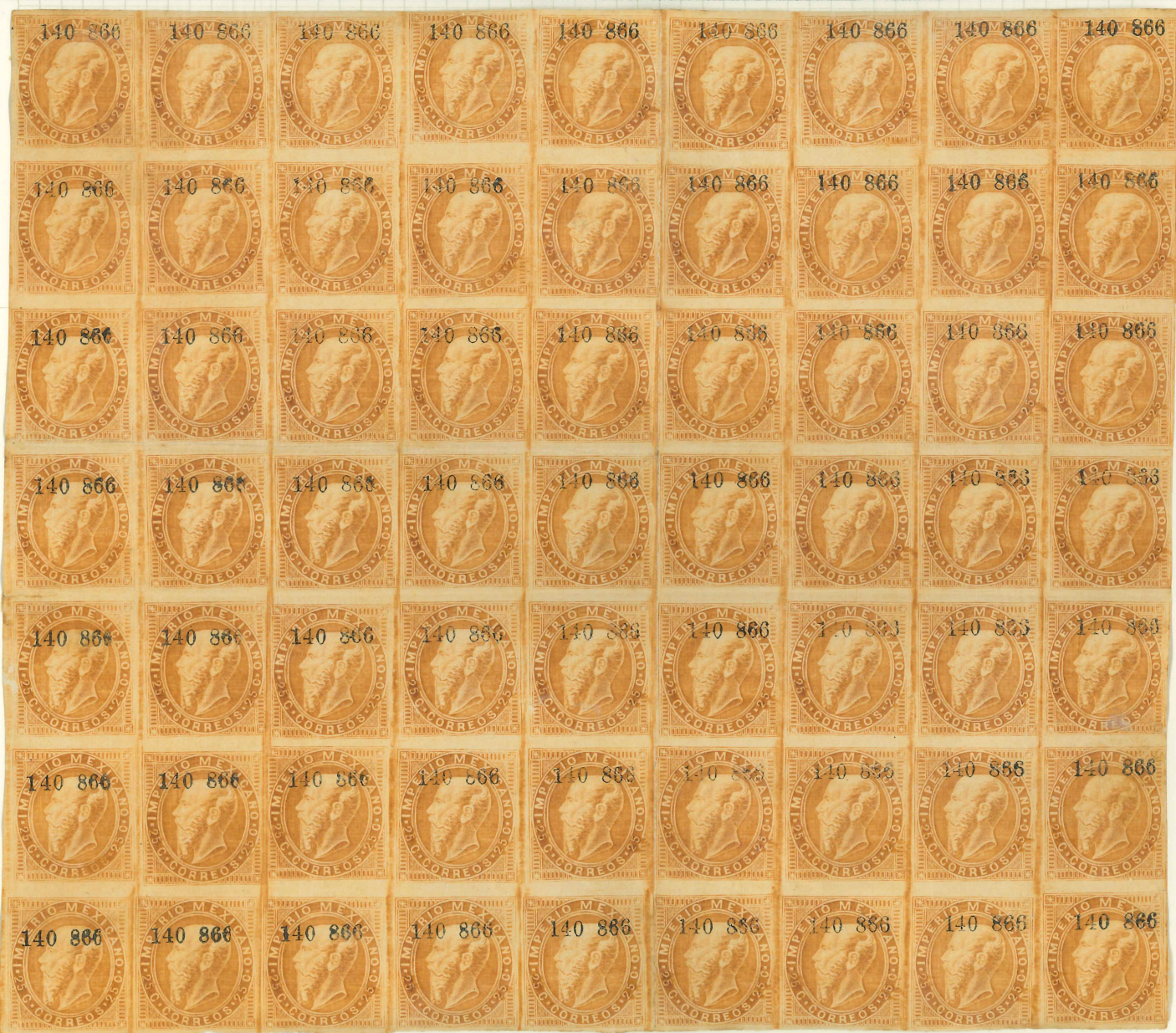
25c ENGRAVED, BLOCK OF 63 OF SHEET OF 200, 5000 CONSIGNED. NO 50c SENT.