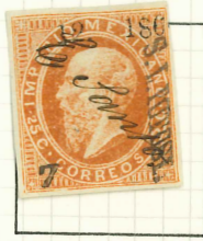
SUB-CONSIGNMENT: 7 TO MOCTEZUMA, USED WITH MANUSCRIPT 'E.SANTO' OF ESPIRITU SANTO.