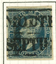
13c, SUB No. 1 USED AT MOCTEZUMA.