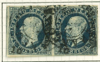
13c DEEP BLUE, 2100 SENT, SUB-NO. 10 TO AHUALCO CANCELLED BY MEXICO CITY DATESTAMPS.