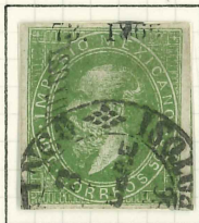
50c DEEP GREEN. ERROR OF INVOICE # 73 FOR 74.

OCTOBER 10, 1866. COVER TO ZACATECAS WITH 25c CANCELLED BY SAN LUIS POTOSI CIRCULAR DATESTAMP.