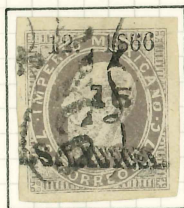
7c LILAC GREY SUB No. 16 USED MATEHUALA. UNRECORDED.