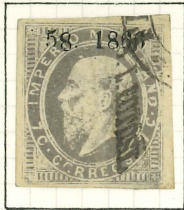
7c LILAC GREY, 3500 SENT. RETOUCHE OVAL UNDER 'MEXICANO'!

CONSIGNED: AUGUST 30, 1866. INVOICE No: 58.