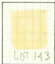
7c ENGRAVED, 400 CONSIGNED. FIRST INVOICE OF 7c.

INVOICE NO: 140. CONSIGNED: DEC 26, 1866.