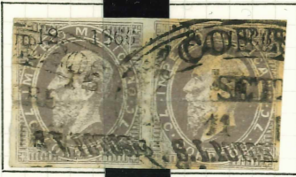
7c LILAC GREY, CANCELLED AT SALINAS, SUB-NUMBER 11 WAS TO VILLA DE SAN FRANCISCO. EX-TAYLOR.