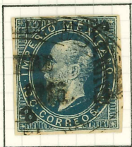
13c, SUB No. 8 USED AT SALINAS DEL PENON BLANCO.