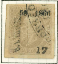
7c PALE GREY LILAC, SUB-CONSIGNMENT 17, MATEHUALA.