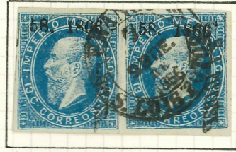
13c PALE BLUE, PAIR USED ON SAME DAY AS COVER, BOTH HAVE DISTRICT O'PRINTS, USED IN SAN LUIS POTOSI.