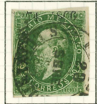
50c DEEP GREEN. 3500 SENT. USED IN S. L. POTOSI.