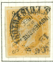
25c USED SAN LUIS POTOSI.