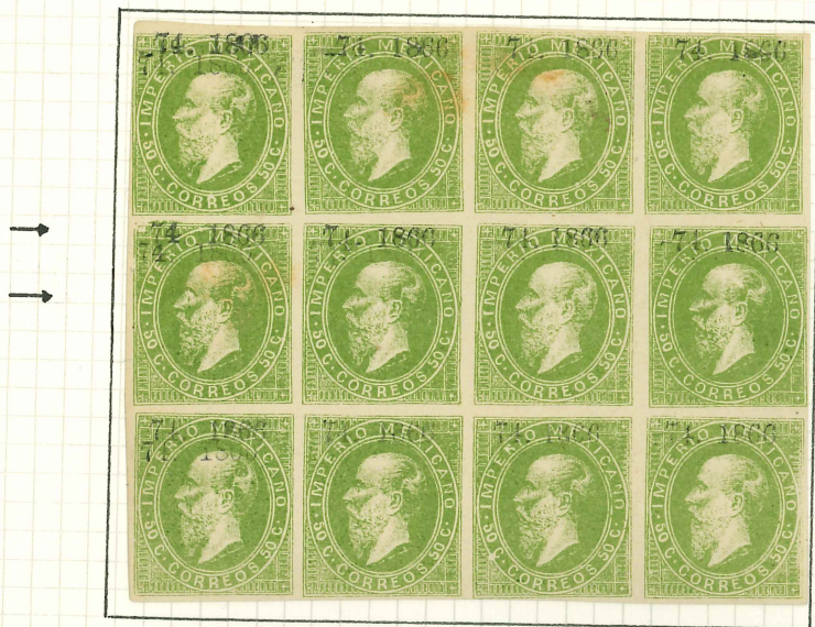
BLOCK OF TWELVE, POSITIONS 1-4, 11-14, 21-24, SHOWING THE 'BLIND EYE' AND BROKEN SPANDREL IN N.W. CORNER ON POSITION