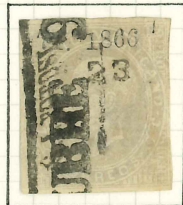
7c PALE LILAC GREY 1050 SENT. SUB-NO. 23 USED IN YENADO.