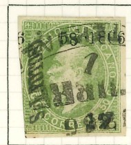
50c SUB-CONSIGNMENT 17 TO MATEHUALA. ONLY RECORDED EXAMPLE.