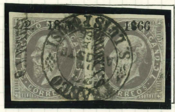
7c DEEP LILAC GREY PAIR USED IN SAN LUIS POTOSI.