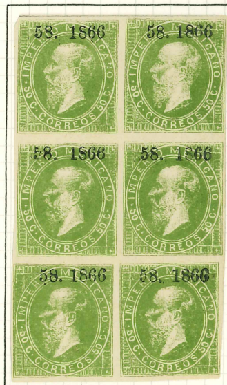
50c YELLOW GREEN, PLATE II, POSITIONS 39-40/59-60. 50 SHEETS, 3500 STAMPS OF 7c, YET 50c INVOICED AT JUST 1050. UNUSUALLY, NO 25c WERE SENT.