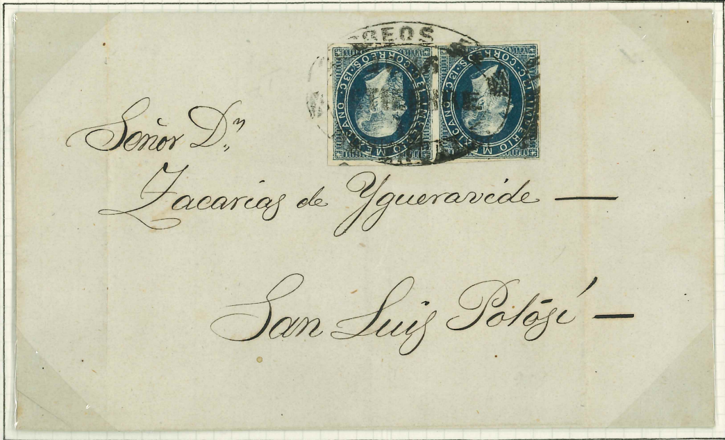
SEPTEMBER 1, 1866. COVER TO SAN LUIS POTOSI WITH PAIR OF 13c SUB-CONSIGNMENT 5.