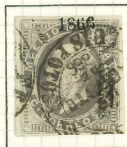
7c, '12' OF '12-1866' OMITTED USED AUGUST 12 th , 1866.