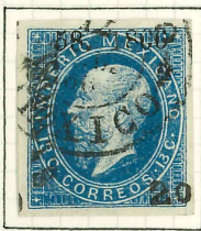
13c BLUE, SUB-CONSIGNMENT #20 TO CATORCE BUT USED MEXICO CITY. 3500 SENT.