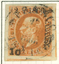
25c DEEP ORANGE, SUB CONSIGNMENT 10, FOR AHUALCO BUT CANCELLED 'FRANCO MEXICO' CDS.