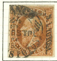
25c VERY DEEP BROWN, USED IN SAN LUIS POTOSI.