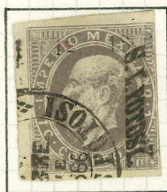
7c LILAC GREY, 2100 SENT. USED AT S.L.P.