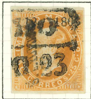
25c ORANGE BROWN, SUB-CONSIGNMENT 2, CANCELLED VENADO.

AUGUST 10, 1866. COVER TO MEXICO CITY WITH 25c, WITHOUT DISTRICT NAME, FROM SAN LUIS POTOSI.