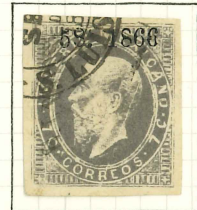
7c LILAC GREY, USED SAN LUIS POTOSI.