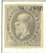
7c LILAC GREY, UNUSED.