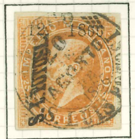
25c, 4200 SENT.