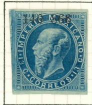
13c ENGRAVED, 3000 CONSIGNED.