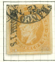
25c USED SAN LUIS POTOSI.