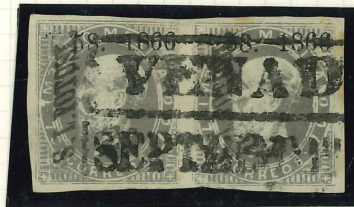
7c, SUB-CONSIGNMENT 21, USED IN VENADO, A 7c ONLY INVOICE. NOTE FLAW ON 'I' OF 'IMPERIO' ON THE LEFT STAMP. EX-BURRUS COLLECTION.