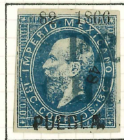
13c BLUE, SUB NO 48, 210 SENT TO CHIAUTLA, USED WITH BLUE FRANCO HAND -STAMP. THE ONLY COLOURED CANCEL KNOWN ON THIS ISSUE.