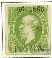
50c, SUB-NUMBER 3 TO MATAMOROS, JUST 30 SENT IN 1867.