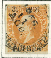
25c, INV 3, USED IN PUEBLA AUGUST 11 th - THE 7c KNOWN USED AUGUST 10.