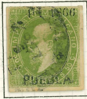
50c, SUB-NUMBER 8 TO TEHUACAN, 35 SENT IN 1867.