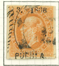
25c ORANGE, PLATE I, SUB-CONSIGNMENT 29 TO TEHUACAN. 700 SENT.