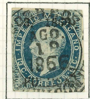
13c BLUE, SUB 14. USED 16 AUGUST. PROBABLE DATE OF DELIVERY.