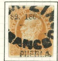
25c, SUB-NUMBER 47. ONE SHEET OF 70 TO CHIAUTLA; USED IN ACATZINGO.