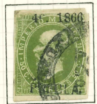
50c IN A VERY DEEP SHADE, USED AUGUST 1866.