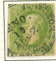
50c USED LATE: JAN 10, 1867 AT PUEBLA. FIVE MONTHS AFTER ISSUE.