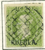
50c USED WITH THE PUEBLA GRILL.