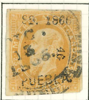
25c, SUB-NUMBER 46. 140 STAMPS SENT TO ACATZINGO; USED IN PUEBLA.