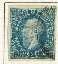
13c, SUB-NUMBER 44, 270 SENT TO TEHUACAN.