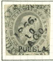
7c PALE GREY USED IN PUEBLA, 1050 SENT. EARLY USAGE: AUG 10 th .