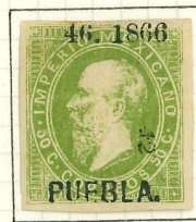
50c, SUB-NUMBER 42 TO TEPEJI, JUST 15 SENT.