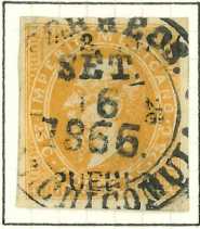
25c YELLOW BUFF, PLATE I, SUB-CONSIGNMENT 28 TO CHALCHICOMULA. 560 SENT.