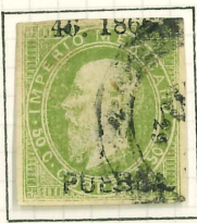
50c, SUB-NUMBER 29 TO TEHUACAN, 140 SENT.