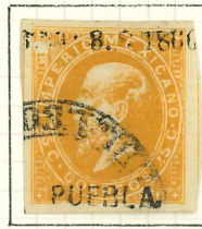
25c POSITION 5, NW CORNER PRIOR TO THE RETOUCH.