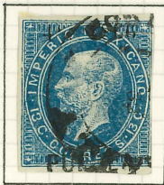
13c, SUB-NUMBER 32, 280 SENT TO ATLIXCO.