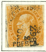
25c SUB-NUMBER 38 TO ACATLAN - LATE USE 3-JAN-67. 210 SENT.