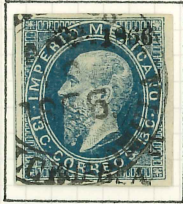
13c BLUE, SUB 14, CHALCHICOMULA. JUST 140 STAMPS - USED 16 th AUGUST.