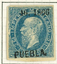
13c, AN UNUSED EXAMPLE