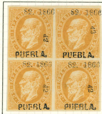
25c, SUB-NUMBER 42, JUST TWO SHEETS (140) WERE SENT TO TEPEJI.