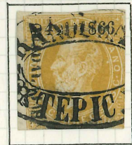
25c, WITHOUT SUB NAME OR NUMBER.