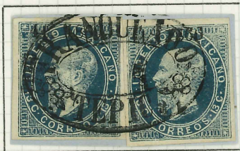
13c, SUB-CONSIGNMENT 31.