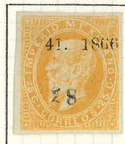
25c, SUB-CONSIGNMENT 28, UNALLOCATED.