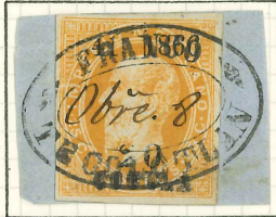
25c, SUB 20 OVERPRINTED COCULA, USED IN TECOLOTLAN.