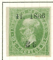
SUB-CONSIGNMENT 36, UNALLOCATED.