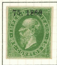
50c DEEP GREEN, 3500 SENT.