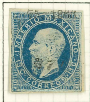
13c, 2450 SENT. SUB-CONSIGNMENT 37, UNALLOCATED, PROBABLY ZAPOTLAN.