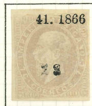
SUB-CONSIGNMENT 28, UNALLOCATED.