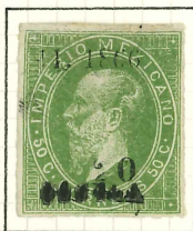
50c, 2450 SENT. SUB- CONSIGNMENT 20 TO COCULA