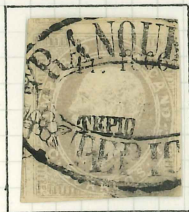
7c, SUB-CONSIGNMENT 31.