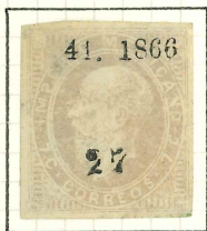
SUB-CONSIGNMENT 27, UNALLOCATED.

CONSIGNED: AUGUST 18, 1866. INVOICE NO: 41.