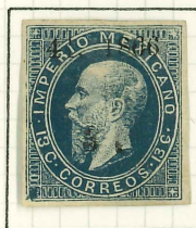
SUB-CONSIGNMENT 36, UNALLOCATED.