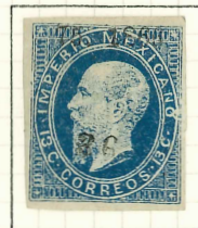
13c, SUB-CONSIGNMENT 36, UNALLOCATED.