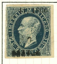
13c, 3500 SENT. SUB- CONSIGNMENT 20 TO COCULA.