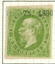
50c, YELLOW GREEN