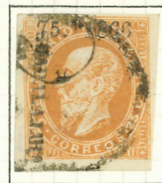
25c, 2500 SENT, USED GUADALAJARA.