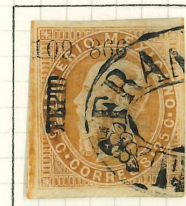
25c WITHOUT SUB NO. OVERPRINTED AND CANCELLED 'TEPIC'.