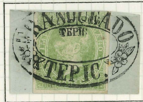
50c, WITHOUT SUB NUMBER.