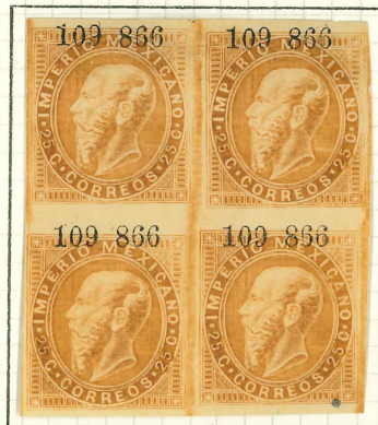
THE 25c WAS THE ONLY VALUE SENT ON INVOICE 109. THE FIRST 25c ENGRAVED INVOICE.