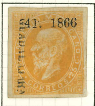
25c, PLATE II. 7000 SENT. FIRST INVOICE FOR PLATE II, FIRST ONE FOR MEXICO CITY ON NUMBER 44.