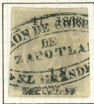
7c PALE LILAC GREY, ORD ZAPOTLAN, SUB NO. 18 USED AT ZAPOTLAN. 2450 SENT.