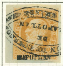
25c, SUB-CONSIGNMENT 35 AND OVERPRINTED 'ZAPOTLAN'.

7c PEARL GREY, LITHO. 13c BLUE, LITHO. 25c ORANGE YELLOW, LITHO. 50c GREEN (SHADES) LITHO. CONSIGNED: SEPTEMBER 15, 1866. INVOICE NO: 75.