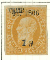
25c, SUB-CONSIGNMENT 19, TEPIC.