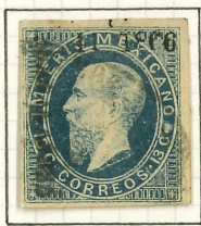
13c DEEP BLUE, 3500 SENT. POSITION 10 ON THE SHEET, FLAW ON 13c & MEXICANO.