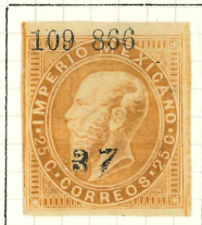
25c, SUB-CONSIGNMENT 37 TO ZAPOTLAN.