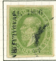
50c YELLOW GREEN, 2450 SENT.