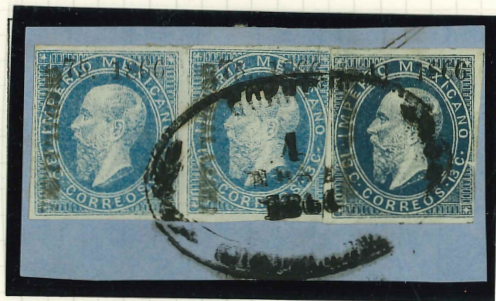
SMALL PIECE WITH PAIR OF 13c FROM INVOICE 75, 2450 SENT; WITH 13c DEEP BLUE INVOICE 41, USED IN GUADALAJARA. EX-GARCIA-LARRANAGA.