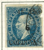
13c, SUB-NUMBER 6, TO PASO DEL MACHO. 140 SENT.