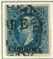
13c BLUE, 2100 SENT.