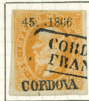
25c, CANCELLED 'CORDOVA-FRANCO'!