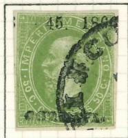
50c YELLOW GREEN, 1750 SENT.