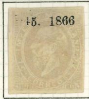
7c PEARL GREY, UNUSED, 700 SENT.