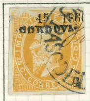
25c, SUB-NUMBER 4, USED PASO DEL MACHO. 280 SENT.

JANUARY 12, 1867. COVER TO VERA CRUZ WITH 25c SUB-NUMBER 4 TO PASO DEL MACHO USED FROM CORDOVA. LATE USAGE: 140 DAYS AFTER CONSIGNMENT, 280 SENT.