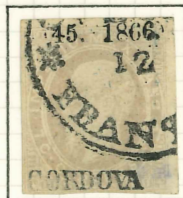
7c USED IN CORDOVA.