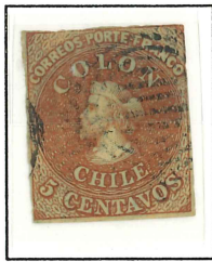
Sheet Pos. 49 CO[R]REOS]