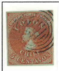
Sheet Pos. 235 [COR]REO[S]