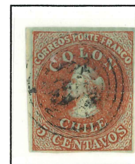
Wmk. Pos. 3