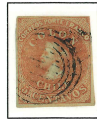
Sheet Pos. 180 [COR]REO[S]