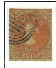
Sheet Pos. 236 [CORRE]OS