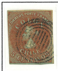
Sheet Pos. 233 C[OR]REOS]