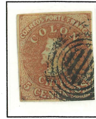
Sheet Pos. 60 [CHIL]E