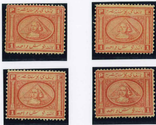
Reconstruction of the four types.