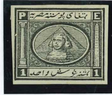
Imperforate Plate Proof in black (Type I).