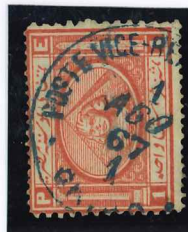
First day of issue used on August 1 st 1867 with blue Cairo cancellation. 1