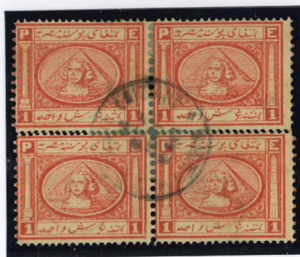
Rejoined block of four. Type III-IV/II-I.