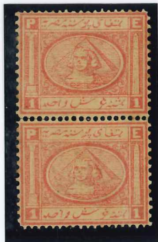
1pi. red. Vertical pair. Type II/IV. Note the extra dot in lower panel at right.