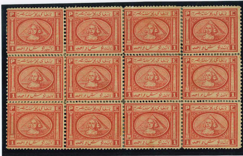
Block of twelve from Stone D. Positions 117-120/137-140 on sheet of 200. Types III-IV-III-IV/I-II-I-II/III-IV-III-IV. From the 1869 printing which is not identifiable by its shade unlike the 10pa. and 20pa. values.