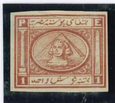
Imperforate Trial Colour Proof of the 1pi. in lake-red.