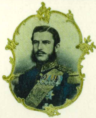
The Principality of Romania - 1866 Prince Carol the 1 st "with whiskers" issue - The 2 parale stamp on thin paper (issued August the 8 th , 1866) - large multiples - part 2 -