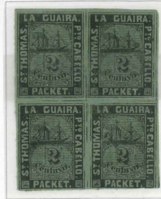
Positions 4-5-9 and 10