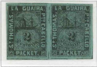
Type I and Type II